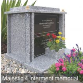
Majestic 4 interment memorial