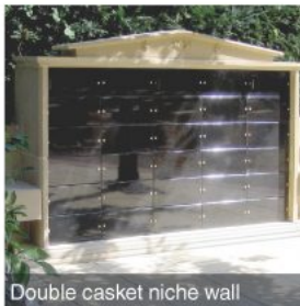
Double casket niche wall