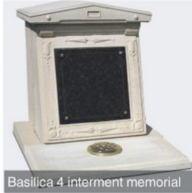
Basilica 4 interment memorial