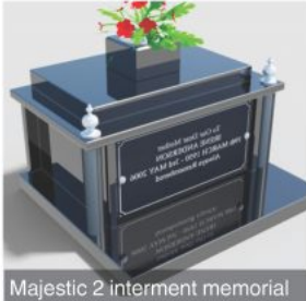
Majestic 2 interment memorial