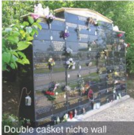
Double casket niche wall