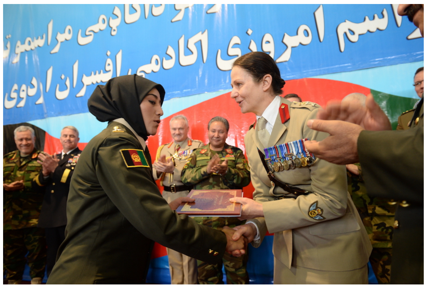
A British officer presents an Afghan cadet with their graduation award.

This work includes supporting efforts to make the Afghan National Defence and Security Forces (ANDSF) a more attractive career choice for women, including improving accommodation arrangements for female ANAOA cadets. Training in the prevention of sexual violence in armed conflict is also provided to cadets as part of the Academy's programme.