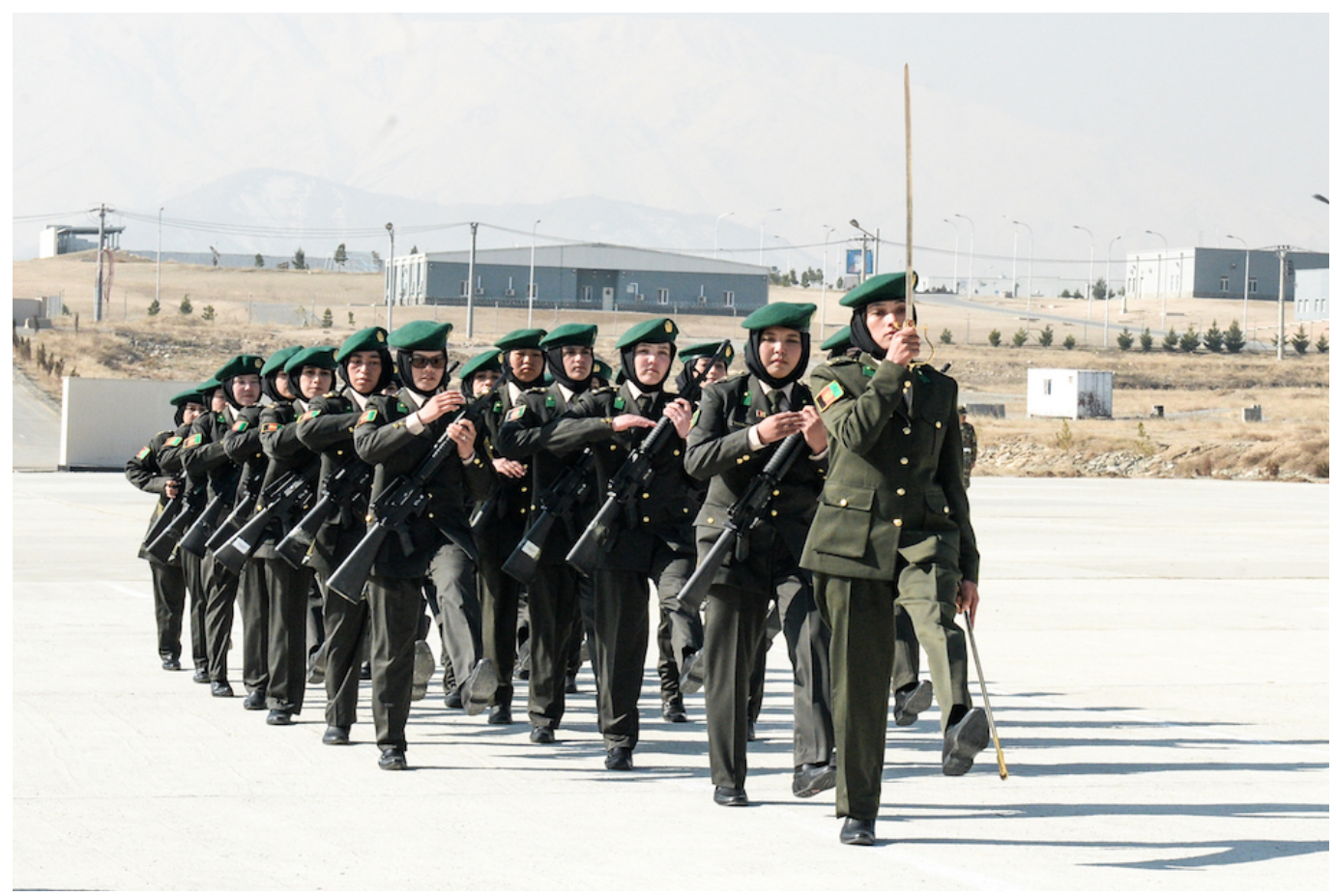
Female officer cadets march at the graduation ceremony.