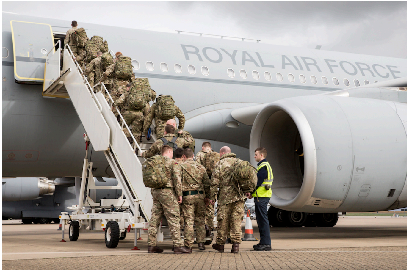
Personnel from the 5th Battalion The Rifles depart from RAF Brize Norton for Estonia.

This week, around 300 UK vehicles have also departed to Estonia, including Warrior infantry fighting vehicles, Challenger 2 tanks and AS90 self-propelled artillery pieces. These vehicles, loaded onto a Roll-On-Roll-Off ferry, are currently on their way and set to arrive towards the middle of next week. French armoured vehicles, including tanks, are also due to arrive in Estonia via train after being loaded yesterday.