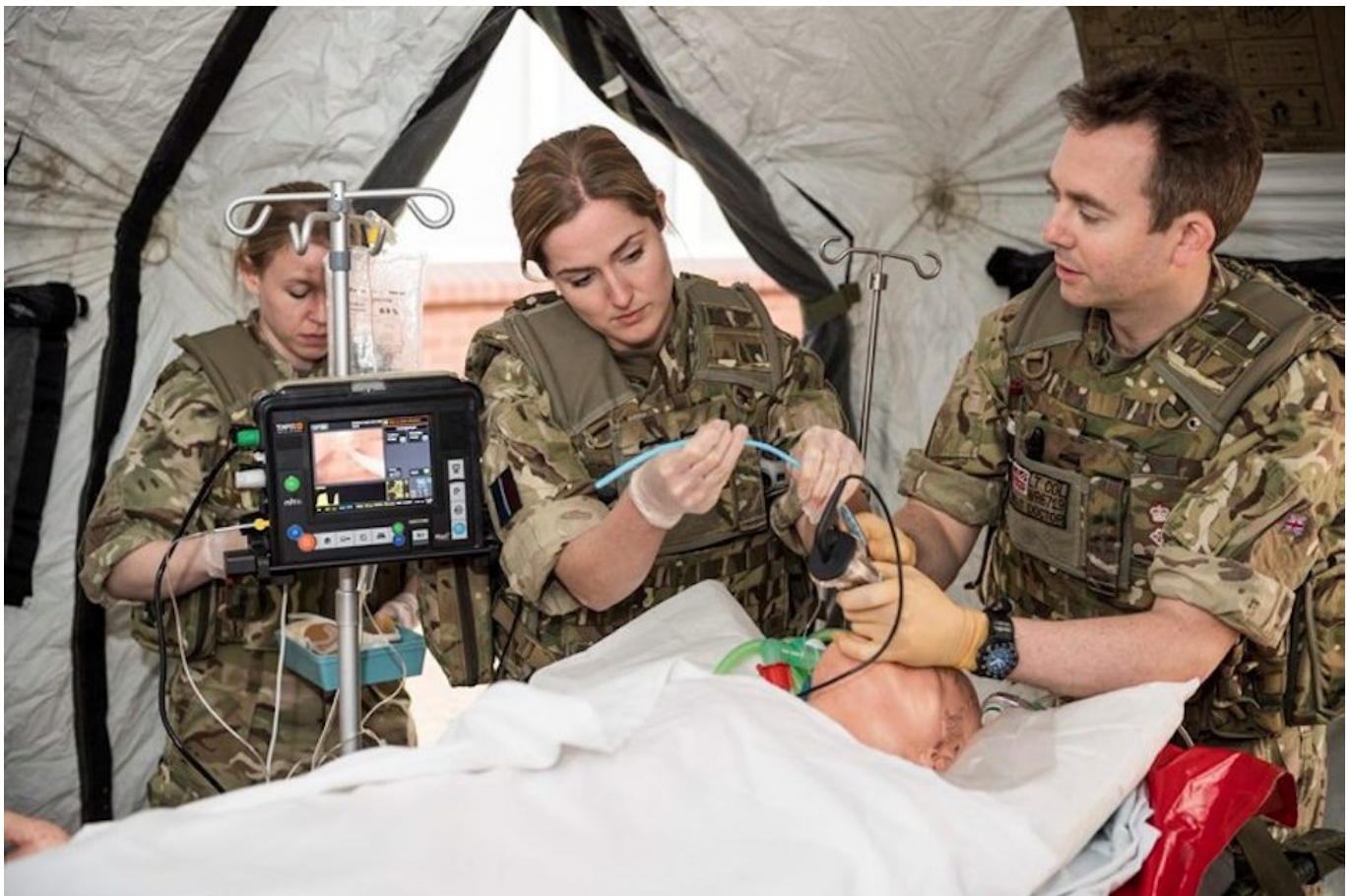
A demonstration of the Tempus Pro medical monitor.

The lightweight, robust and portable monitor, which is battery operated, can be used on land, at sea and in the air. It transmits medical data such as blood pressure, pulse and respiratory rate in real time back to medical facilities and treatment teams, giving them a better understanding of a patient's condition ahead of time.