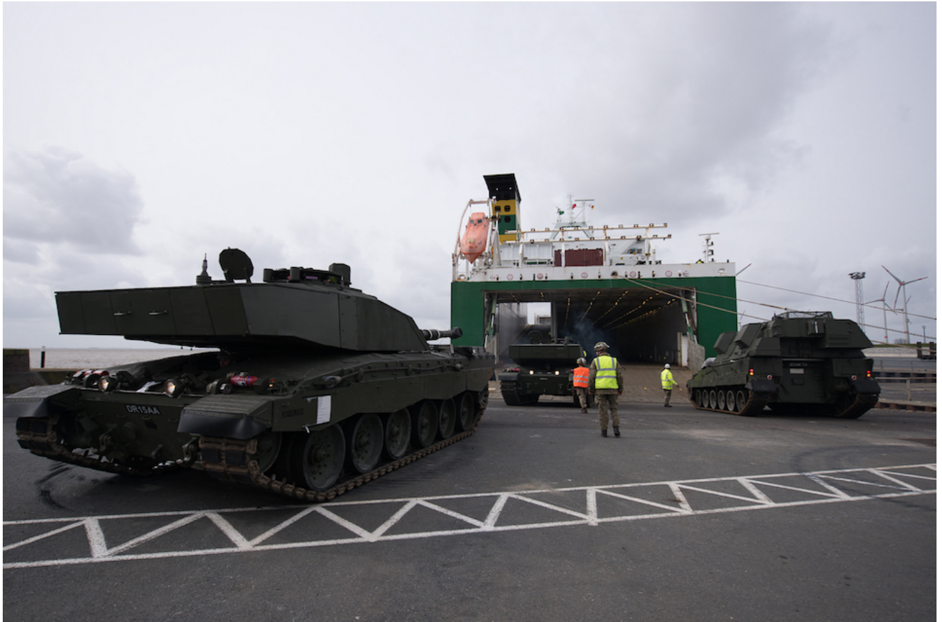
An AS90 and a Challenger 2 tank being loaded onto cargo ship in the port of Emden, Germany, before deployment to Estonia.

The UK-led Estonia Battlegroup is one of four NATO multinational deployments to the eastern part of the Alliance. Other nations are deploying to Latvia, Lithuania and Poland, the last of which will include 150 UK personnel, on a persistent, rotational basis.