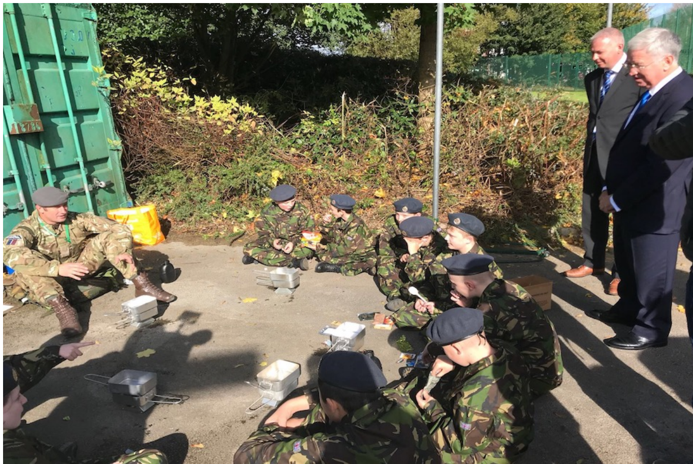
The Defence Secretary observes cadets during a lesson at Albion Academy.