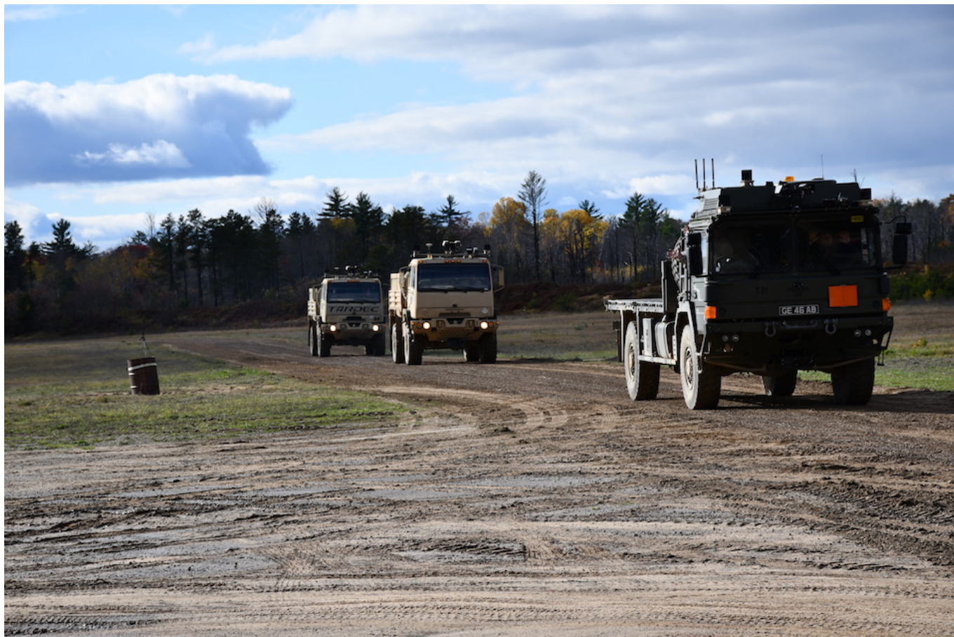
A British Army MAN SV 6-tonne truck leading two US Light Medium Tactical Vehicle trucks in a driverless convoy.

This is a new way of coordinating and delivering vital supplies to front-line operations, aiming to reduce risk to those troops and provide on-demand delivery of food, fuel or ammunition to the front line. The Coalition Assured Autonomous Resupply (CAAR) demonstration, the first in a three-year project to bring concepts to life, marked initial demonstration of unmanned tactical resupply technologies in the three areas.