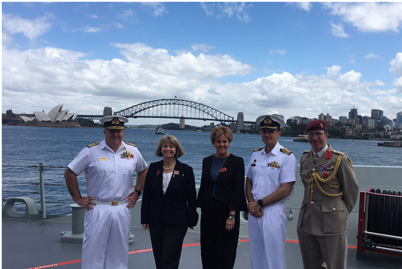
Minister Baldwin touring Australian Navy Fleet Command facilities in Sydney.

The visit to Australia comes shortly after Minister Pyne came to London and met Minister Harriett Baldwin earlier this month.