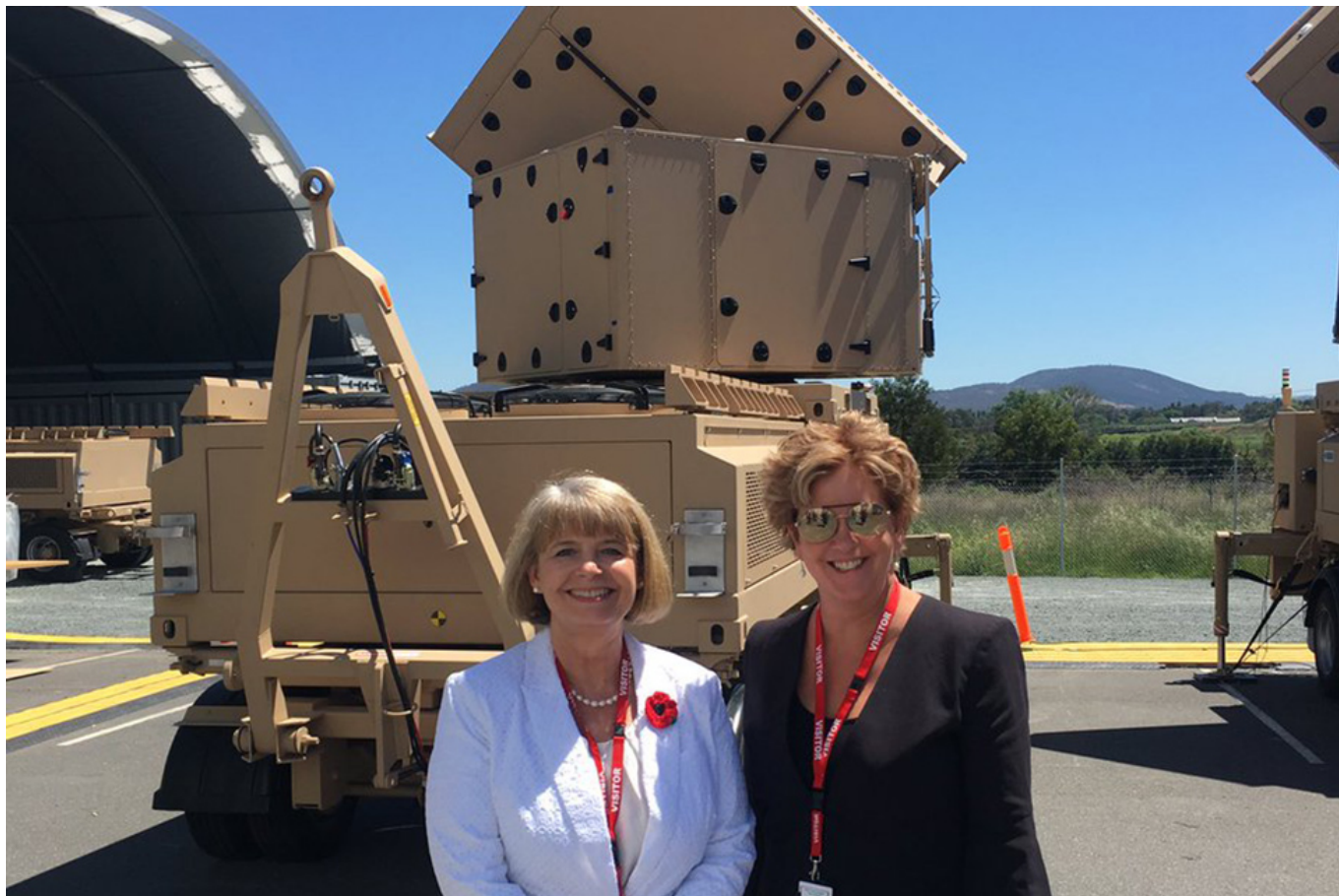
Minister Baldwin at CEA with British High Commissioner to Australia, Menna Rawlings, looking at radar systems.

The Defence Minister also laid a wreath on behalf of the UK at a Remembrance Sunday commemoration event in Canberra on Saturday.