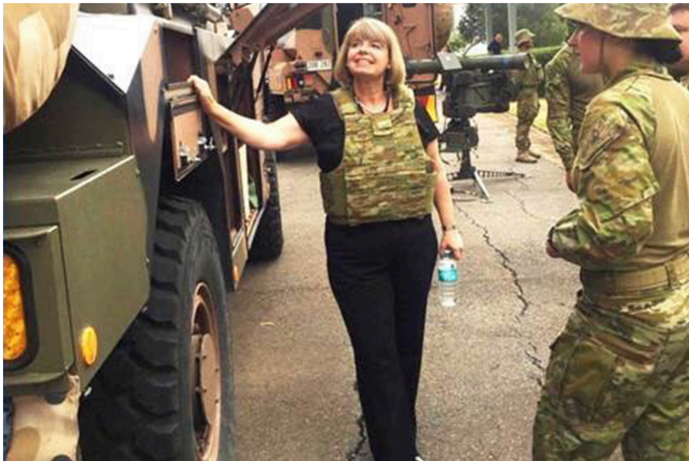
The Australian Army show Minister Baldwin the Bushmaster vehicle.

On the flipside of the countries' export relationship, the UK was Australia's fifth largest export destination in 2016, valued at almost A$15bn. Whilst in the country, the Defence Minister viewed a Bushmaster Protected Mobility Vehicle demonstration.