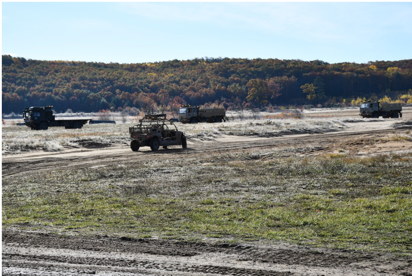
A remote-operated 4x4 being tested by the British and US Armies out in Michigan.

Following the communique signature between the two nations in 2014, we have been working closely with our American counterparts to develop effective demonstrations and assessments of important new autonomy technologies, which could one day reduce the burden on and risk to the military user, while improving logistics efficiencies and interoperability.