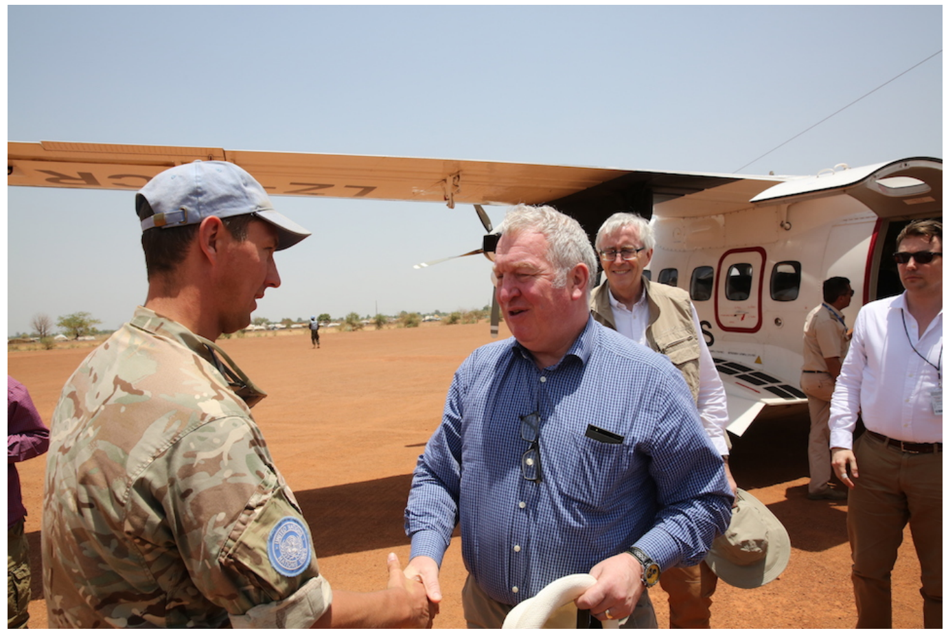
Armed Forces Minister Mike Penning arrives in South Sudan

This permanent field hospital will support over 1,000 UN peacekeepers and staff, enabling them to continue working to improve conditions in South Sudan.