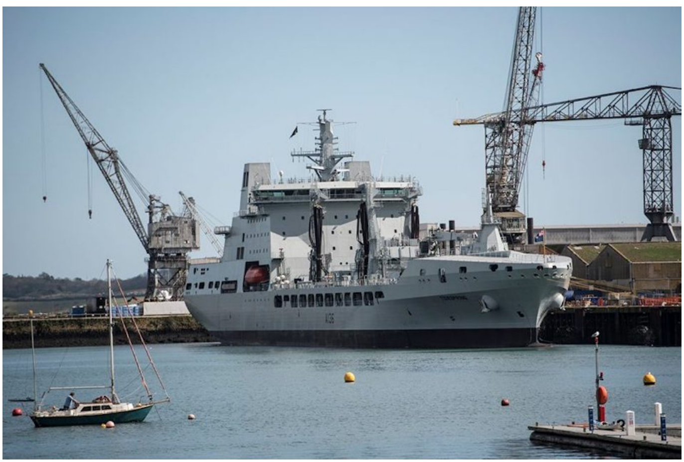
RFA Tidespring.