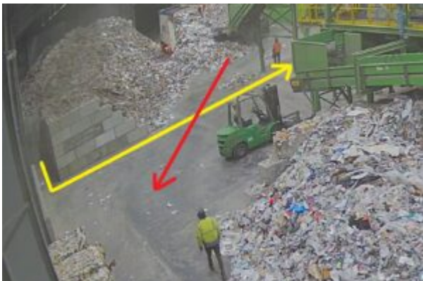
Ward recycling site in Hartlepool