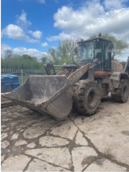
Photograph of loading shovel