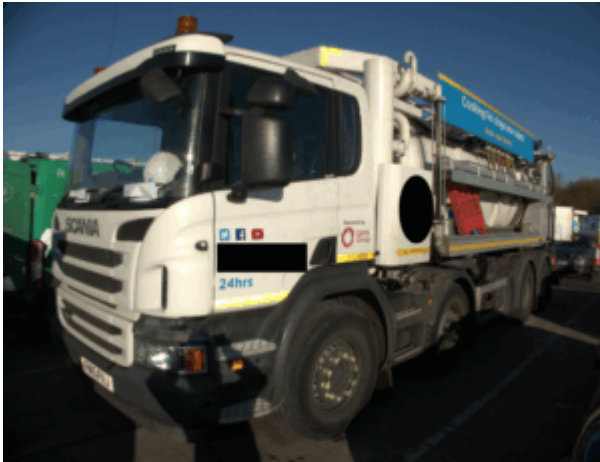
The jetting tanker

hose was suspended in an inspection chamber when a large pressure release, thought to be due to a build-up of ice in the system, caused the end of the hose to strike Mr Galvao in the face.