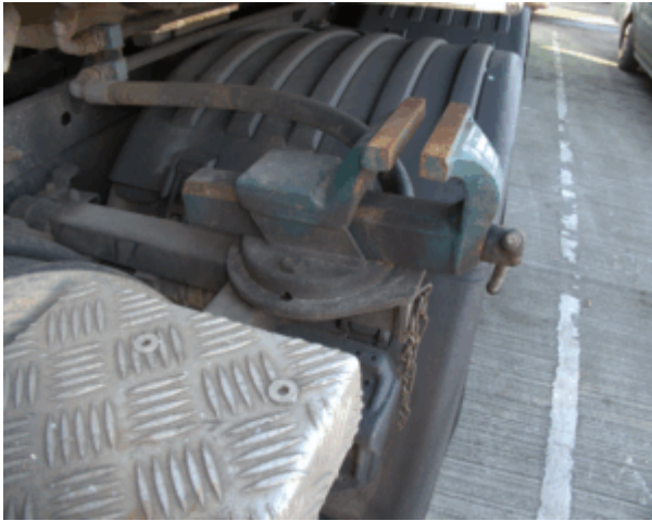
The vice on the vehicle that should secure the hose