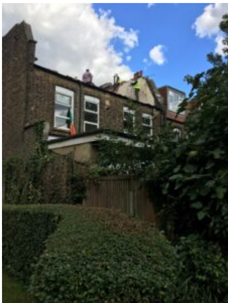
Mr Ali put workers at risk of falling from height

Workers had been identified working on the roof area where they were at serious risk of falling from a height as no measures to protect them were in place. Unplanned and unsafe demolition work had also left the building structure at risk of collapse.