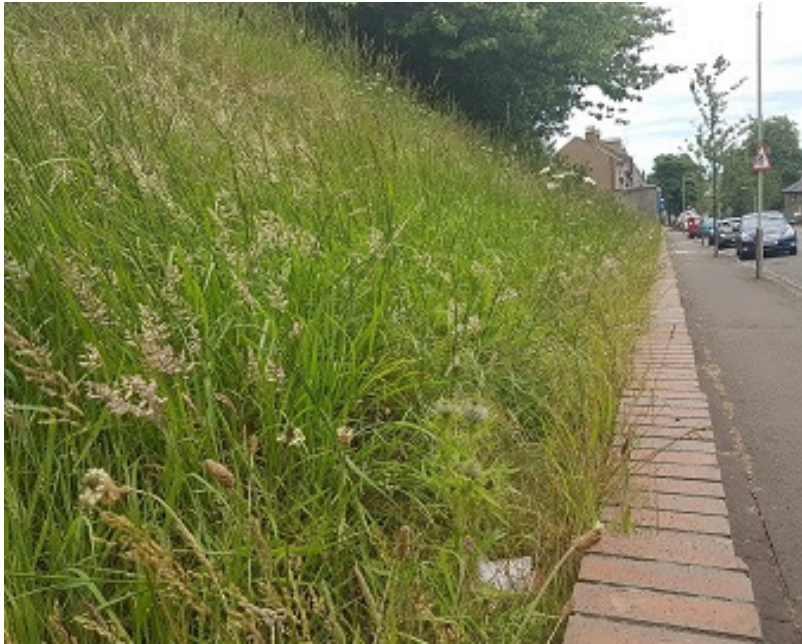
Scott Street – west end