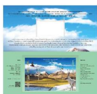
Presentation Pack (Inside).