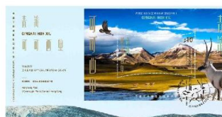
Serviced First Day Cover affixed with a $10 Stamp Sheetlet and date-stamped with associated special postmark.