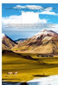
Presentation Pack (Inside).