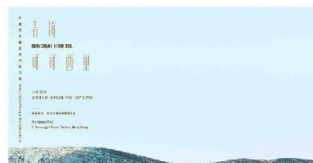
Blank First Day Cover.