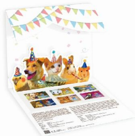
Presentation Pack (Inside).