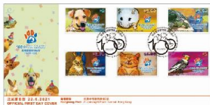
Serviced First Day Cover affixed with a set of mint stamps in six denominations (date-stamped with special postmark).