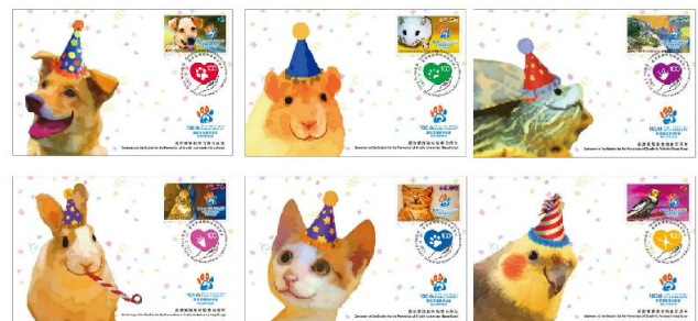
A set of six cards each depicting one animal showed in the mint stamp and affixed with the corresponding mint stamp on the picture side (date-stamped with a corresponding colour postmark).