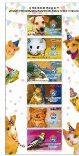
Collector Card (Front).