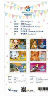
Collector Card (Back).