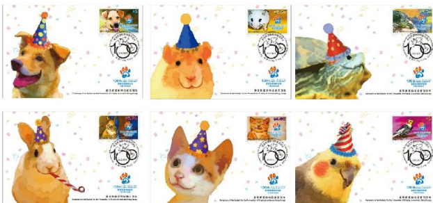
A set of six cards each depicting one animal showed in the mint stamp and affixed with the corresponding mint stamp on the picture side (date-stamped with special postmark).