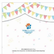
Presentation Pack (Cover).