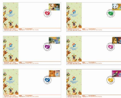
A set of six serviced First Day Covers each affixed with a stamp of different denomination (date-stamped with a corresponding colour postmark).