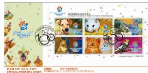
Serviced First Day Cover affixed with a Souvenir Sheet (date-stamped with special postmark).