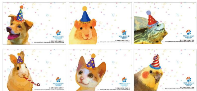
Postcards (a set of six cards).