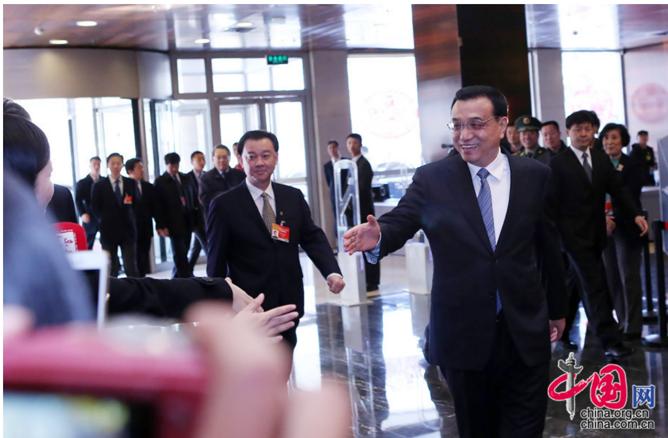
Chinese Premier Li Keqiang goes to join political advisors in their panel discussions on Saturday.

Chinese Premier Li Keqiang and other senior leaders on Saturday joined political advisors in their panel discussions concerning the nation's economic and social development.