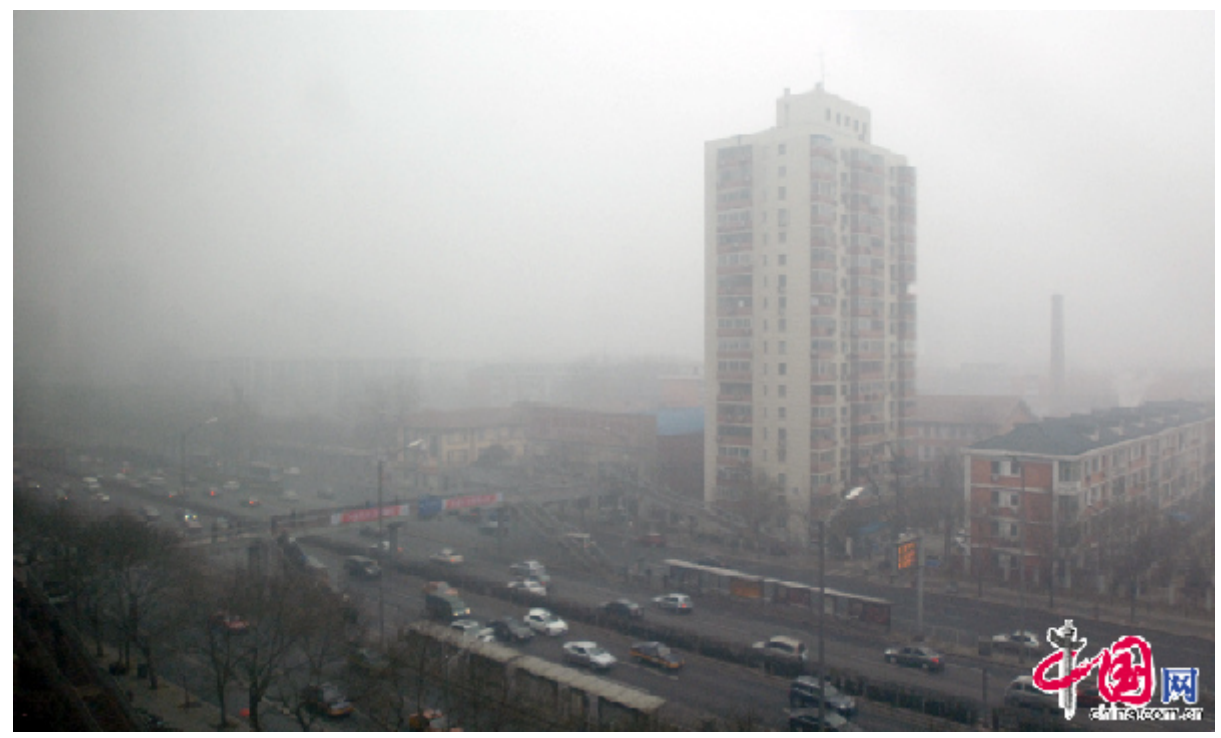
Heavy smog hits Beijing.

In a show of anti-pollution resolve, China has begun shaming rogue firms that had allegedly polluted environment and even blocked government inspections.