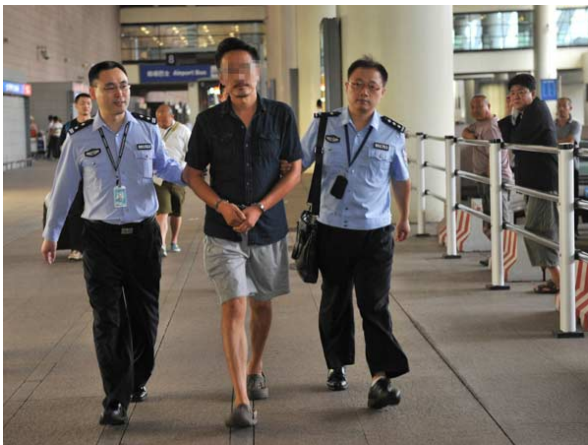
An unidentified fugitive returns from Indonesia to China.

China Wednesday released an update on the cases of 40 corruption fugitives on the Interpol red list who have either voluntarily returned or been extradited to China, including two spared from prosecution.