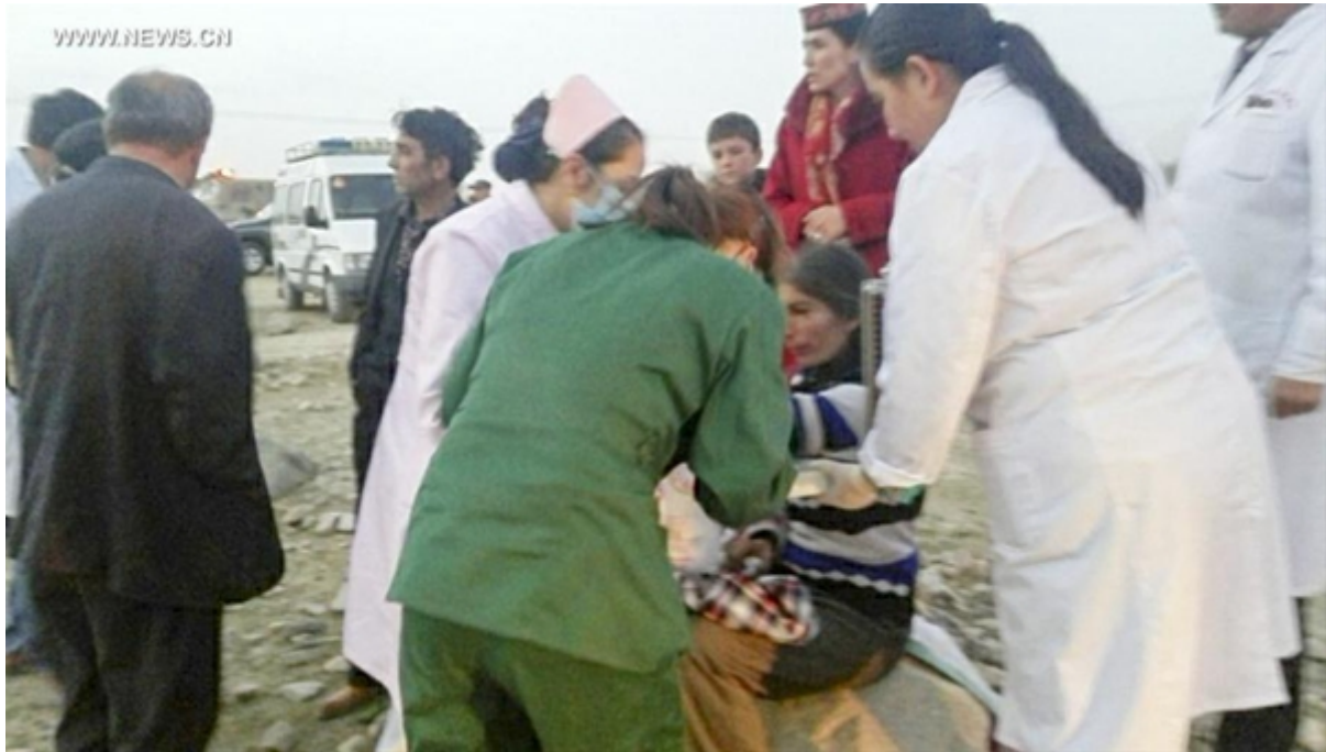
Residents receive treatment at Kuzigun Village in Taxkorgan County, northwest China's Xinjiang Uygur Autonomous Region, May 11, 2017.

Eight people have been confirmed dead and 11 others were injured after a 5.5-magnitude earthquake jolted Taxkorgan County in northwest China's Xinjiang Uygur Autonomous Region at 5:58 a.m. Thursday.