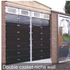
Double casket niche wall