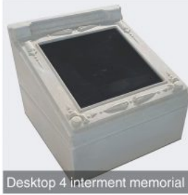
Desktop 4 interment memorial

welters® ORGANISATION WORLDWIDE Design and Innovation Cremated Remains Above Ground Interment