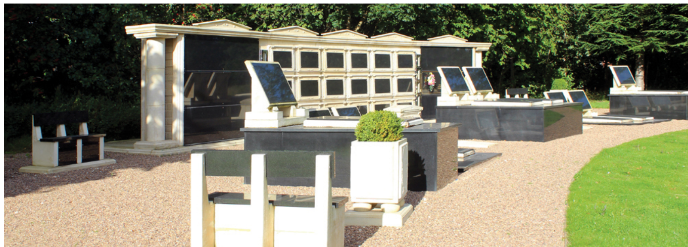
An example of welters' mausolea, sarcophagi and burial chambers

welters organisation introduced the concept of single cast burial chambers, mausolea cells and memorial housings to the industry over 30 years ago and the company continues to design, manufacture, supply and install these facilities nationwide. By operating its own manufacturing facility, the company avoids using third party concrete producers or subcontractors and it also employs dedicated site installation teams to ensure unrivalled service delivery. welters® are presently installing new community mausolea, sarcophagi and burial chambers for a large Midlands based Authority. The installation forms part of a long standing provision of interment facilities carried out over many years, serving both Christian and Muslim communities.