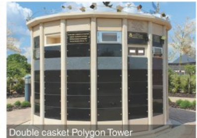
Double casket Polygon Tower