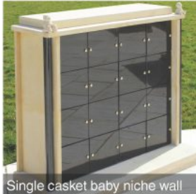
Single casket baby niche wall