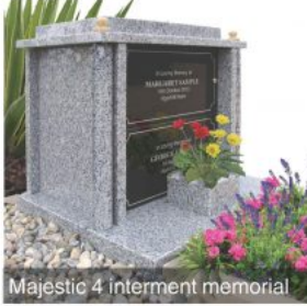
Majestic 4 interment memorial