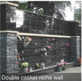
Double casket niche wall