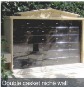
Double casket niche wall