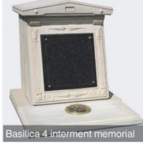
Basilica 4 interment memorial