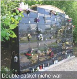
Double casket niche wall