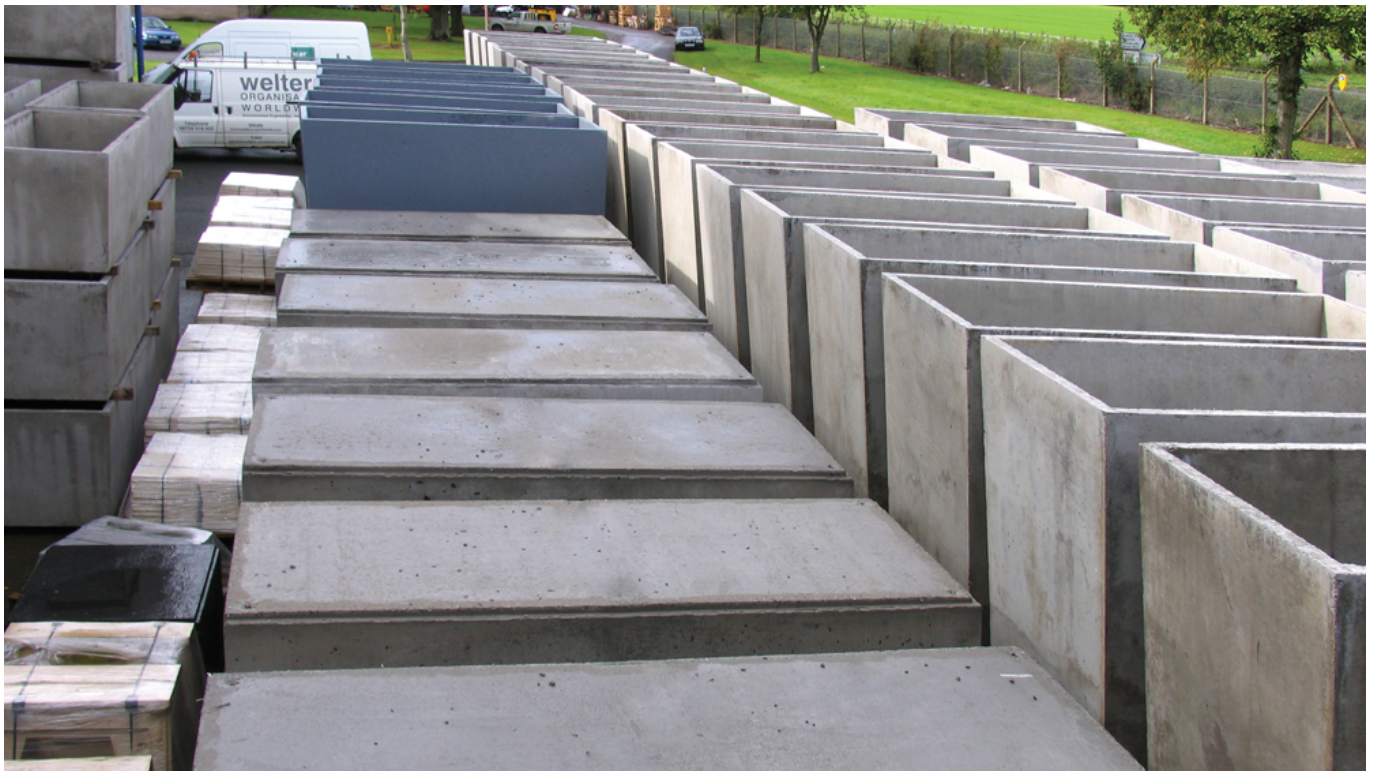
welters manufacturing facility

For over thirty years, the company has striven to ensure that it has the ability to design, manufacture, supply and install their entire OPC and decorative stone components at its own manufacturing facility, negating the need to use third party concrete producers or installation contractors. This means that the design, production and delivery of all projects is maintained and administered from within the company, giving WOW a strong foundation for a reliable and lasting service provision to its clients.