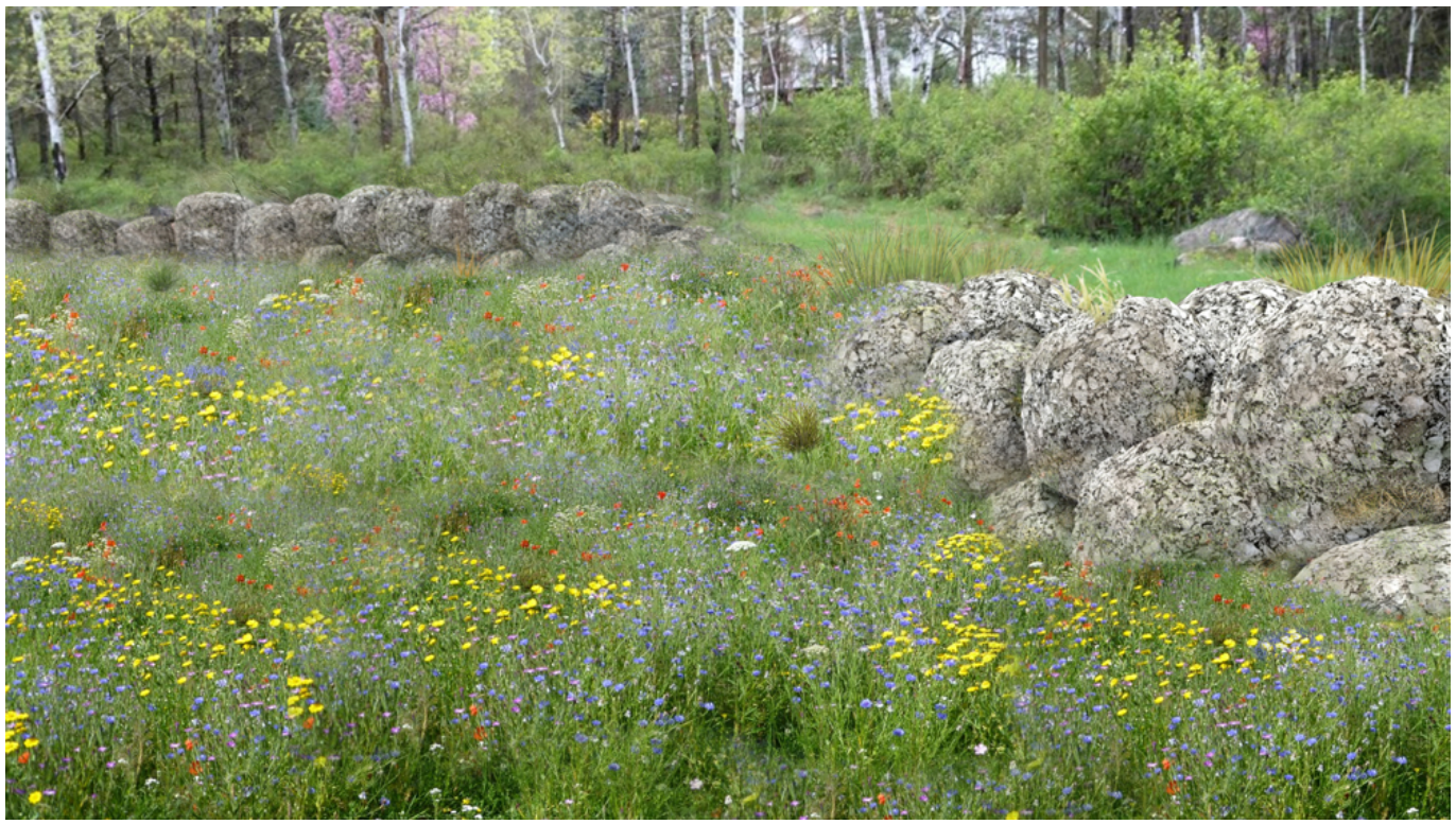
Example visual of Landscape Orbs used for bank stabilisation

As part of welters® commitment to achieving zero waste working practices, all by-product materials produced in cast stone manufacturing is now being utilised as a structural landscape commodity.