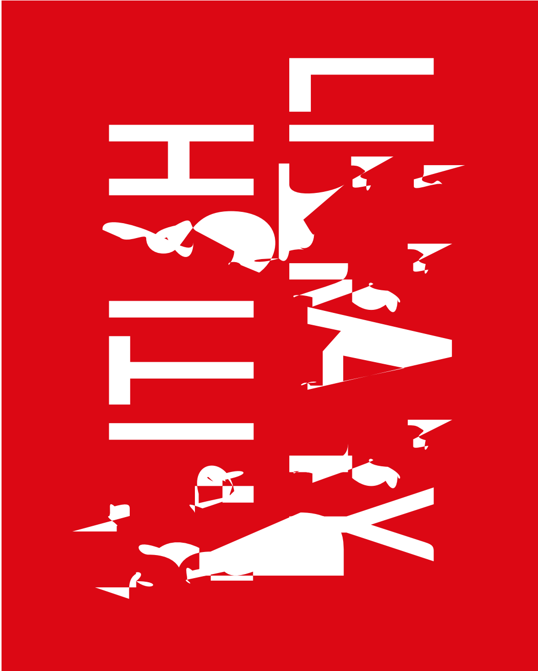
Portrait of Sir John Blackwood McEwan by Reginald Grenville Eves

Visit Chamber Music on British Library Sounds to listen to more performances by the London String Quartet.