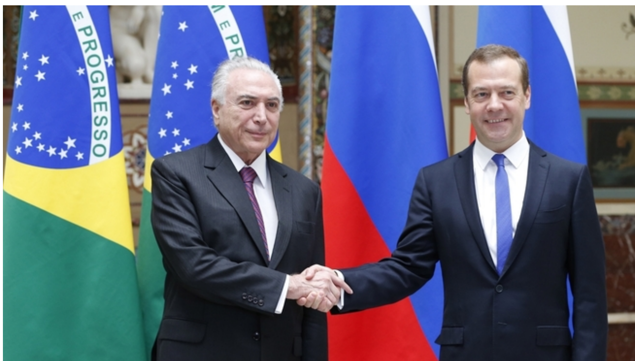
Meeting with President of Brazil Michel Temer