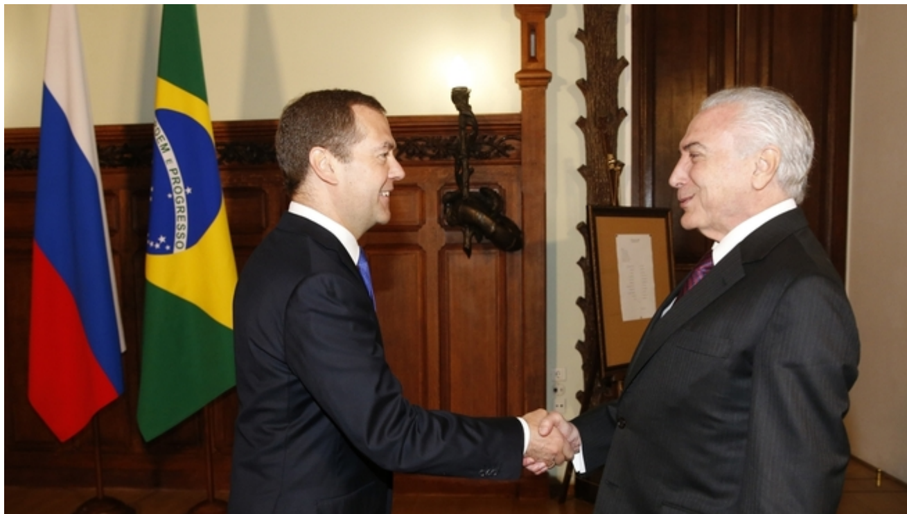
Meeting with President of Brazil Michel Temer