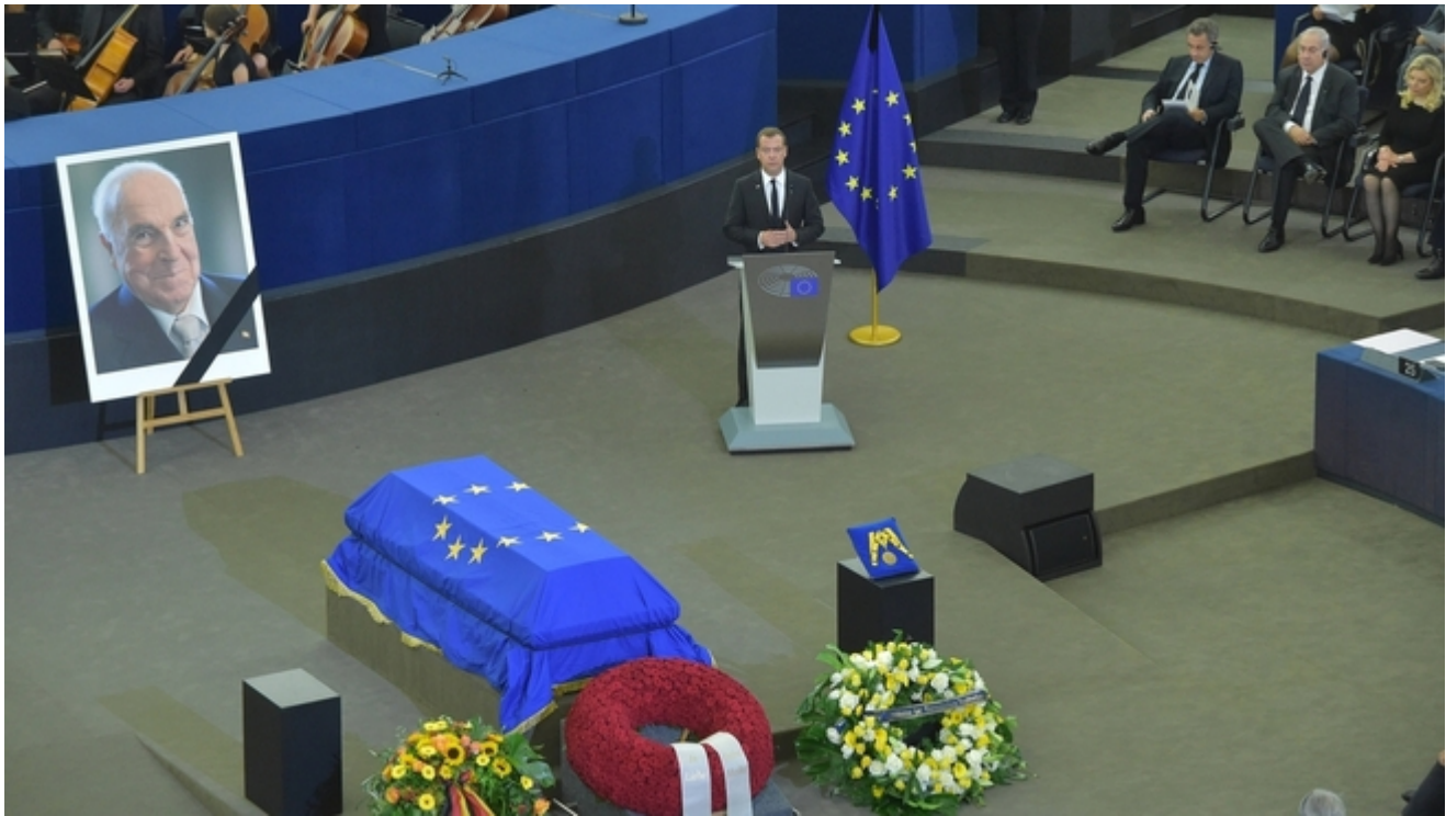
The memorial ceremony for former Federal Chancellor of Germany Helmut Kohl