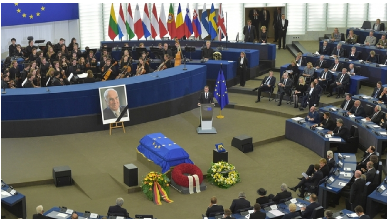
The memorial ceremony for former Federal Chancellor of Germany Helmut Kohl