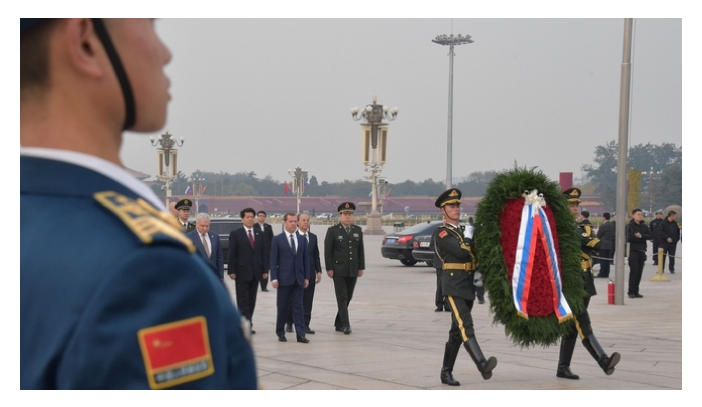
Dmitry Medvedev lays a wreath at the Monument to the People's Heroes