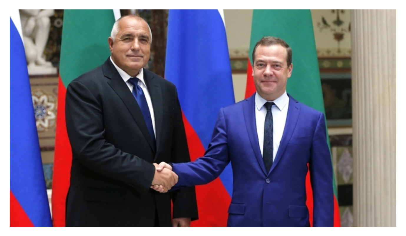
Meeting with Prime Minister of Bulgaria Boyko Borisov