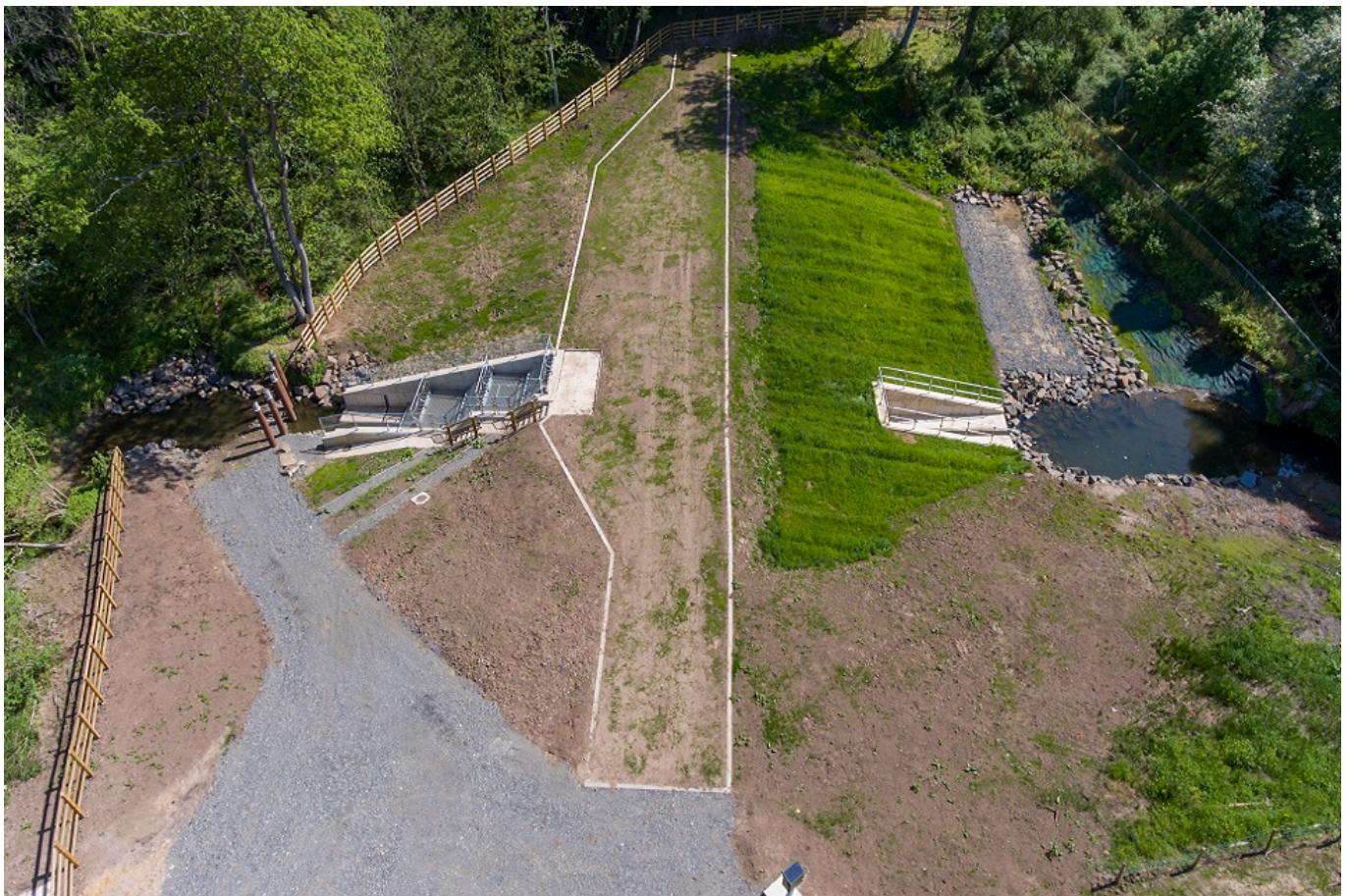
Cotting Burn dam aerial image

The dam works alongside other flood protection measures to reduce flood risk to around 1,000 properties in Morpeth.