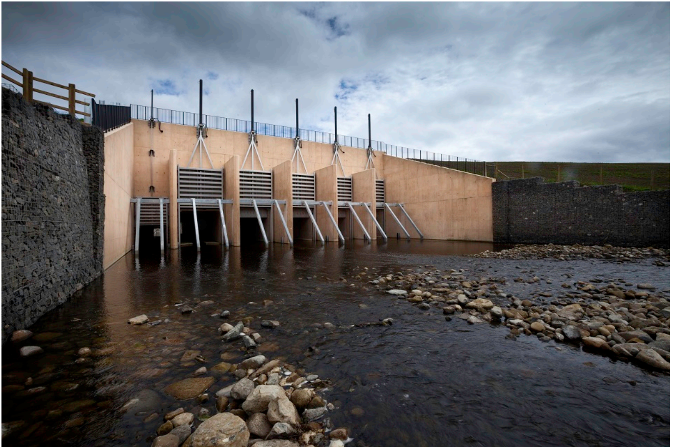
The large dam at Mitford

This has been a great partnership involving local residents, who have played, and continue to play, a vital role in the success of the scheme. It shows that by working together with others we can create long term solutions to reduce the risk of flooding in our communities.