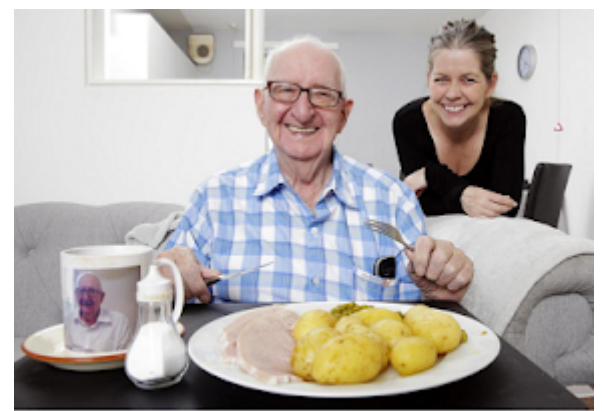
Could you spare an extra portion of dinner for an older neighbour? Cooks needed in Dundee

Loneliness and isolation has been magnified for all of us this year and particularly at Christmas.