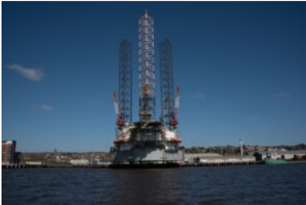
Valaris 121 was being taken back to Dundee

Following the incident, the company replaced all polymer grating across its fleet with galvanised steel grating.