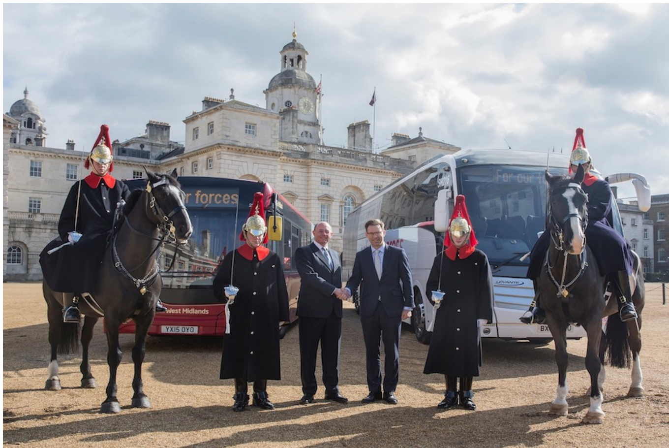
Defence Minister Tobias Ellwood at the National Express re-signing on Horse Guards Parade.

National Express Group Chief Executive Dean Finch said: