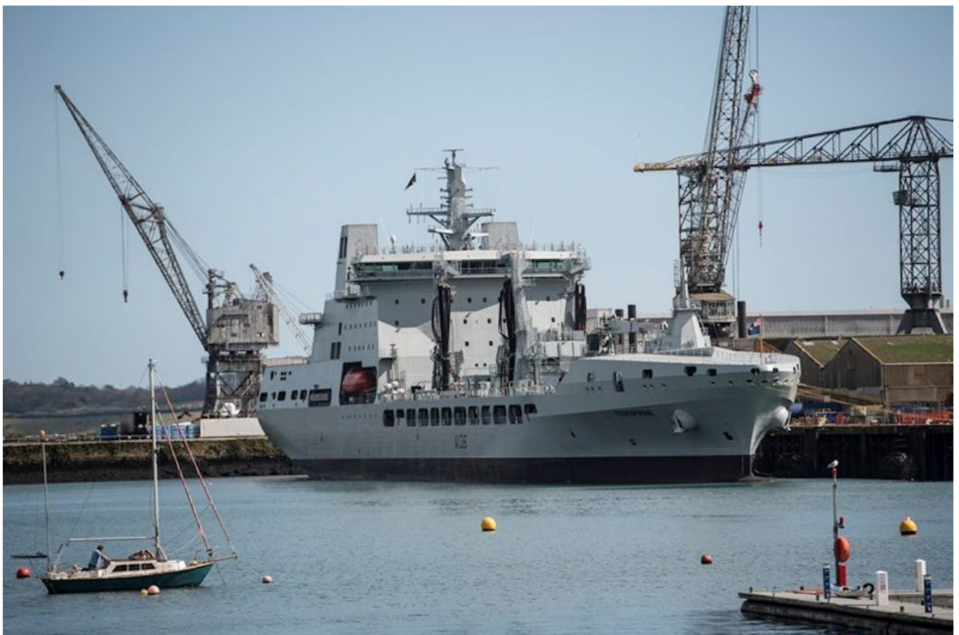
RFA Tidespring.

Systems to be installed in Falmouth include the communications equipment, self-defence weapons and armour needed to allow the ship to operate in the most challenging environments.