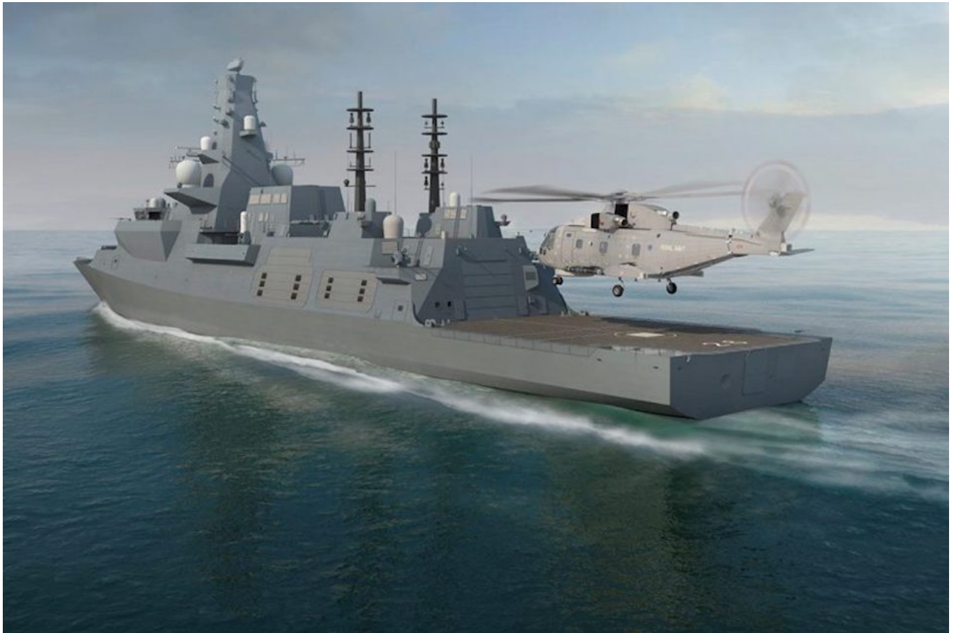
A Computer Generated Image of the Royal Navy's new Type 26 frigate.

Although designed to fight and win in the most demanding scenarios, they will also work alongside our international partners to protect and promote the United Kingdom's interests around the world.