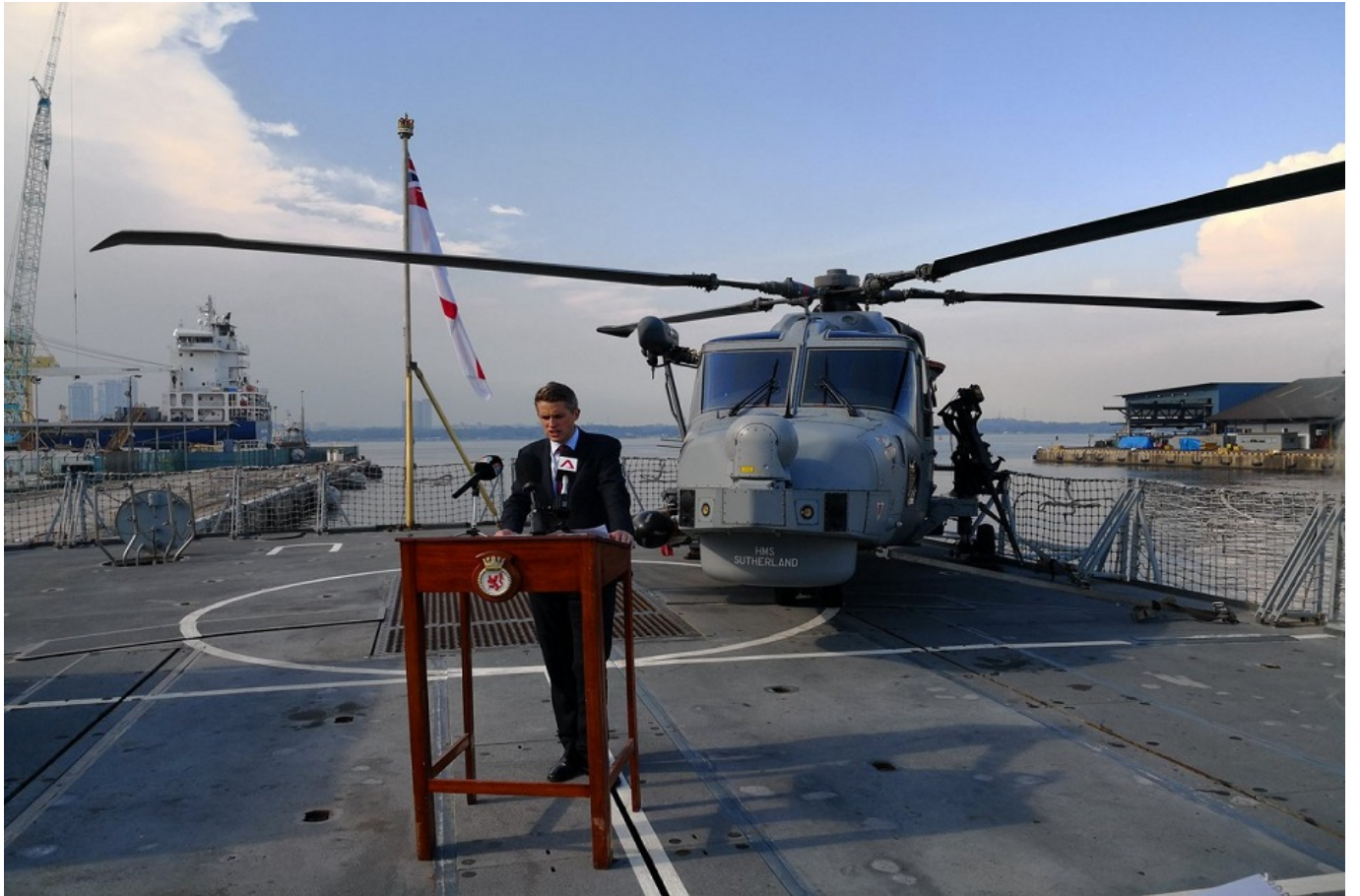
Defence Secretary Gavin Williamson speaking on board HMS Sutherland.