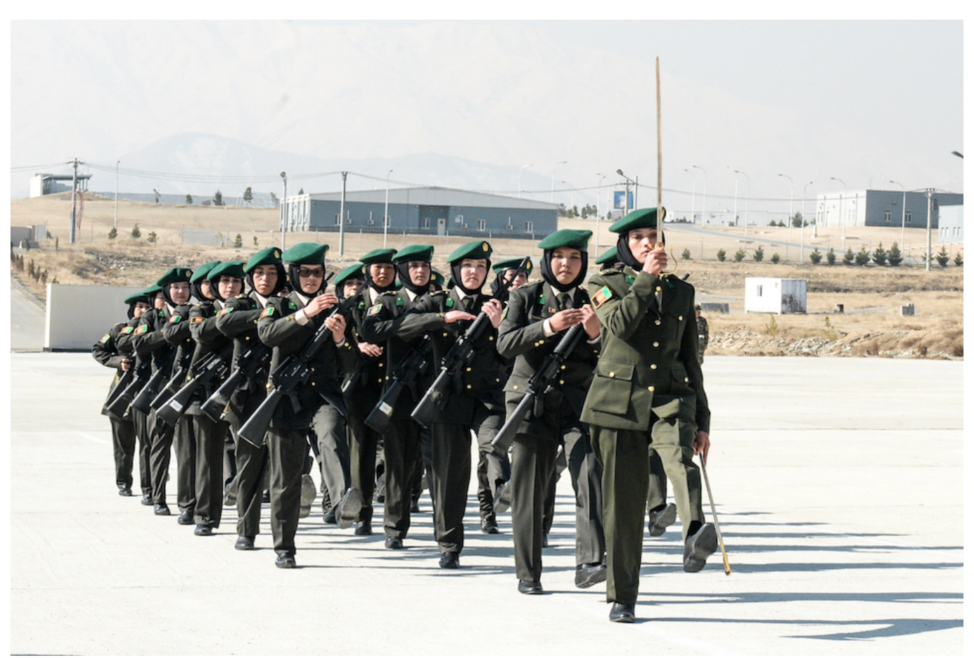
Female officer cadets march at the graduation ceremony.

This year's class has the largest number of female graduates to date, with 23 officer cadets graduating today.