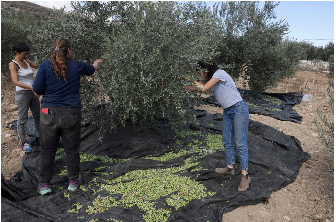
Israeli activists of the Rabbis for Human Rights organization help Palestinian farmers harvest their olive trees in Burin village in the occupied West Bank, on Oct.19 2021.

“Palestinians have a right to elect representatives to their national institutions. That requires a Palestinian leadership decision, as well as supportive, not preventive, steps by Israel and the International community.