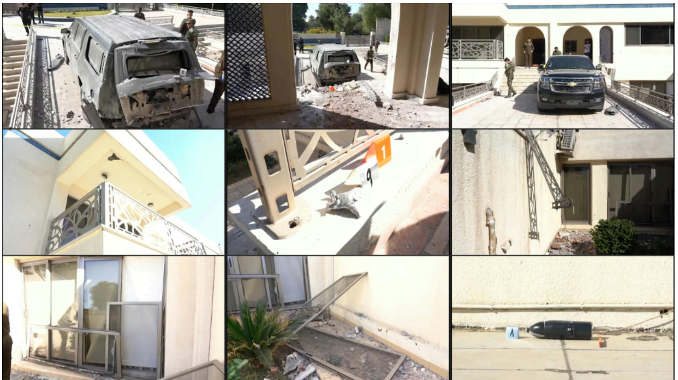
Security forces inspect the aftermath of a drone strike on the prime minister’s residence.