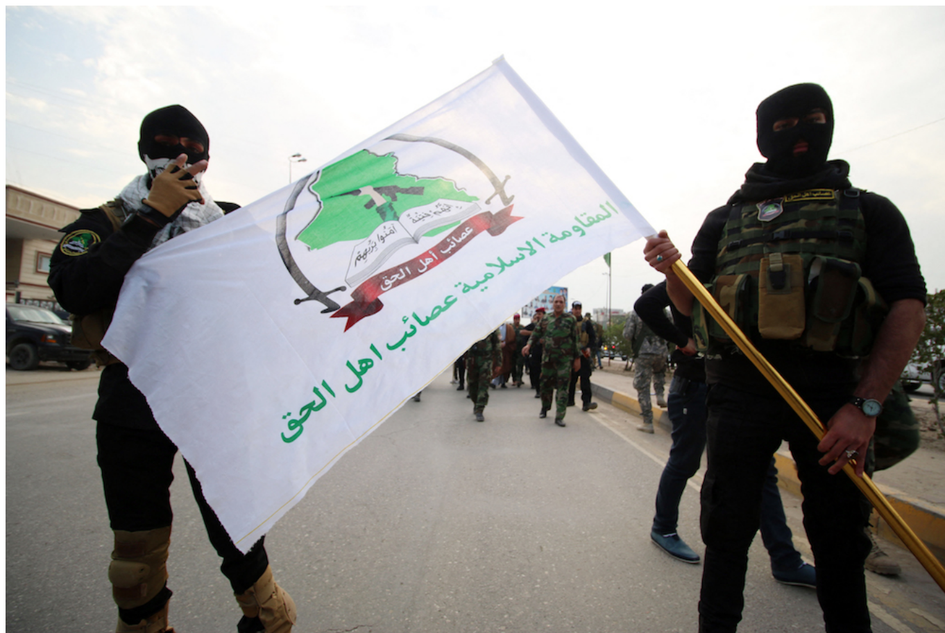
Iraqi Shiite members of the Asaib Ahl Al-Haq group (The League of the Righteous) units gather in the southern city of Basra.

years. "Militias have had the power to largely do as they please since 2003. That's because they were part of, and supported by, the government. That doesn't look to be changing anytime soon," he told Arab News.