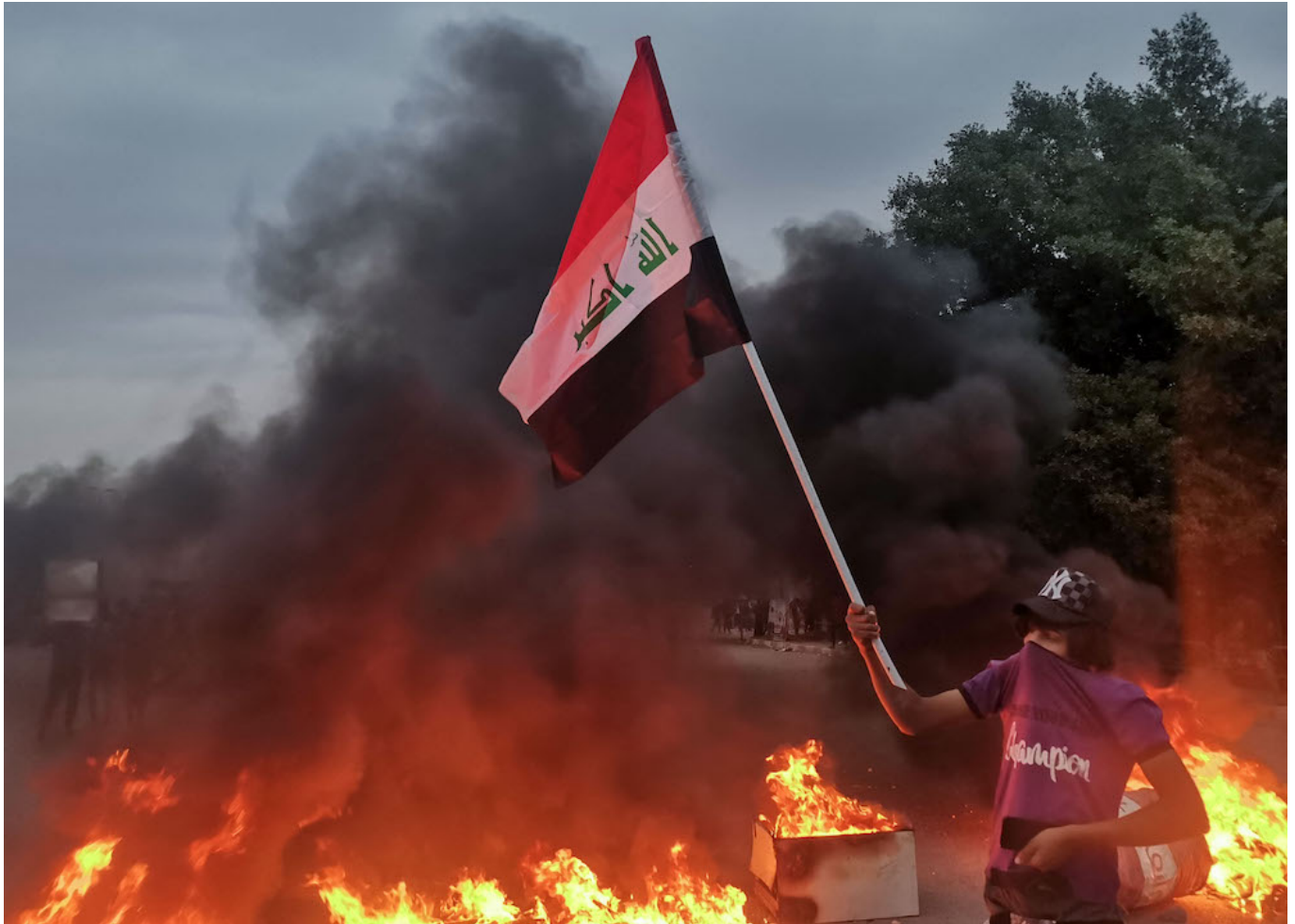
A demonstrator lifts a national flag by burning tyres amid clashes between Iraqi anti-government protesters and supporters of firebrand Shiite cleric Muqtada Sadr.

“In Iraq, every group wants to be part of the state so that it can exploit the oil money,” he told Arab News.