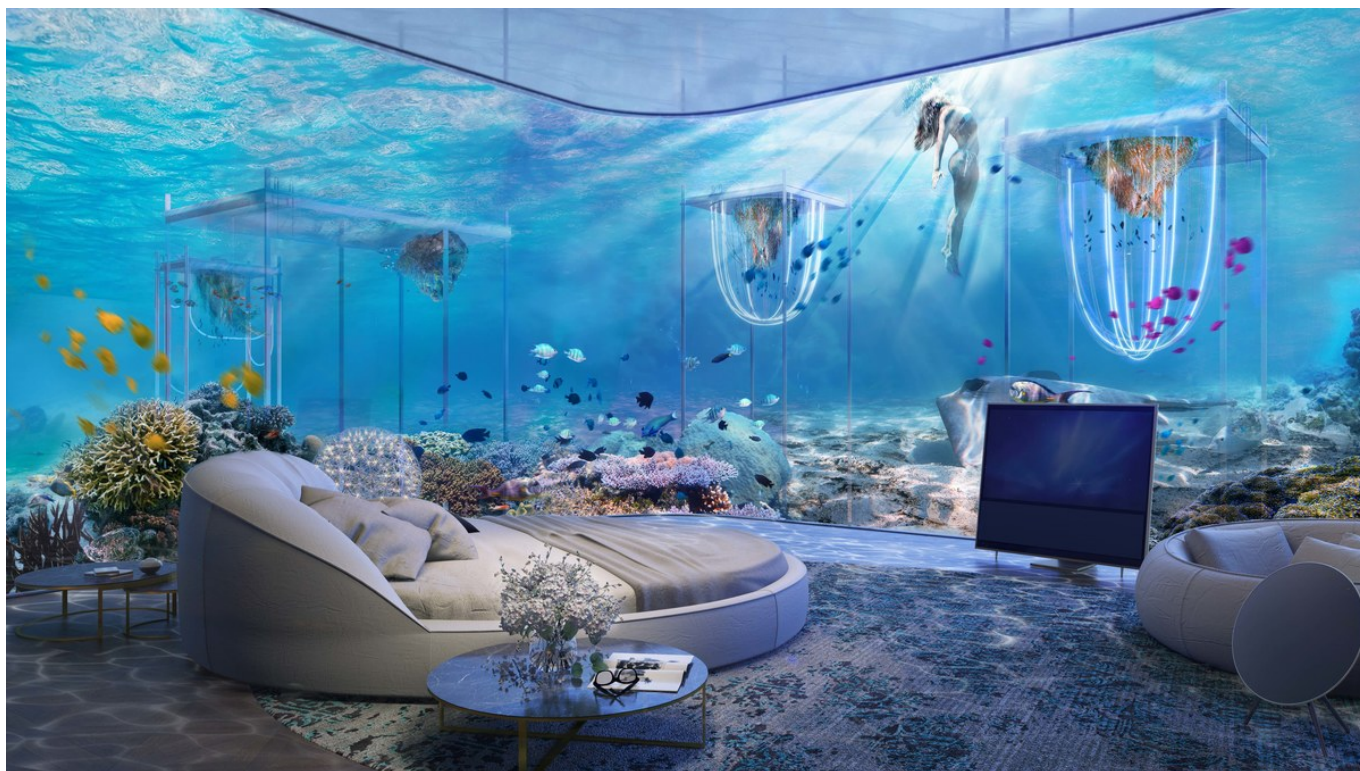
THE FLOATING LIDO

“Tourism is also a highly fragmented sector; 80 percent of businesses in tourism are small and medium-sized enterprises who rely on guidance and support from sector leadership. The sector must be part of the solution.”