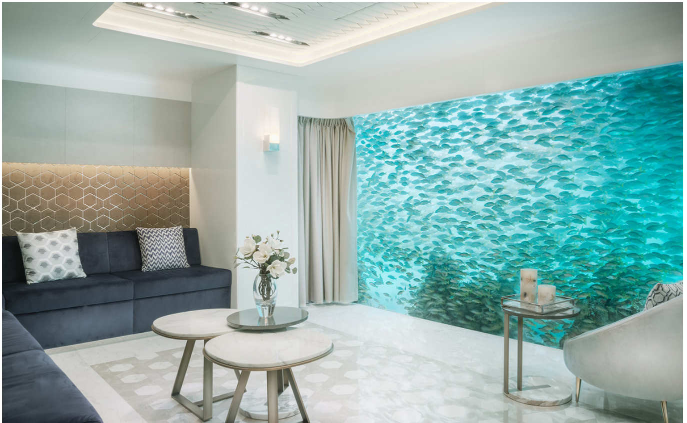
THE FLOATING SEAHORSE

But urban areas not immune to the risks either and, as such, they too are being forced to adapt.