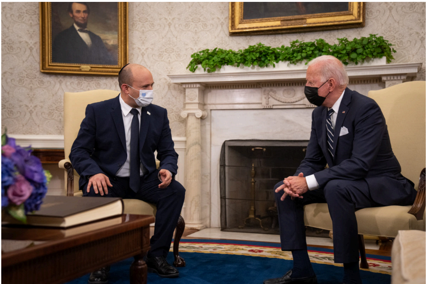
US President Joe Biden meets with Israeli Prime Minister Naftali Bennett at the White House on August 27, 2021 in Washington, DC, during talks focused on

Where this line is drawn remains a point of contention between Biden and Bennett’s national security teams. Failure to reach a common position could result in unilateral Israeli action against Iran’s nuclear infrastructure. And, yet, the rift seems wider than ever.