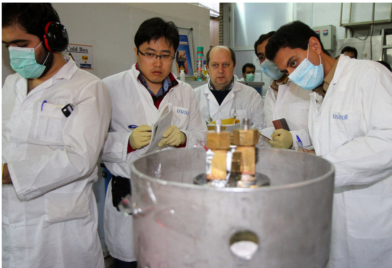
Inspectors of the International Atomic Energy Agency had been repeatedly denied complete access to Iranian nuclear facilities.

“Both Israeli officials and the US military leadership believe there is a need to have a credible military threat to deter Iran’s nuclear program. However, they are at odds with Biden’s political appointees at the State Department, National Security Council, and Colin Kahl – the number three official at the Pentagon – who remain under the delusion that appeasement toward Iran is the best path forward.”