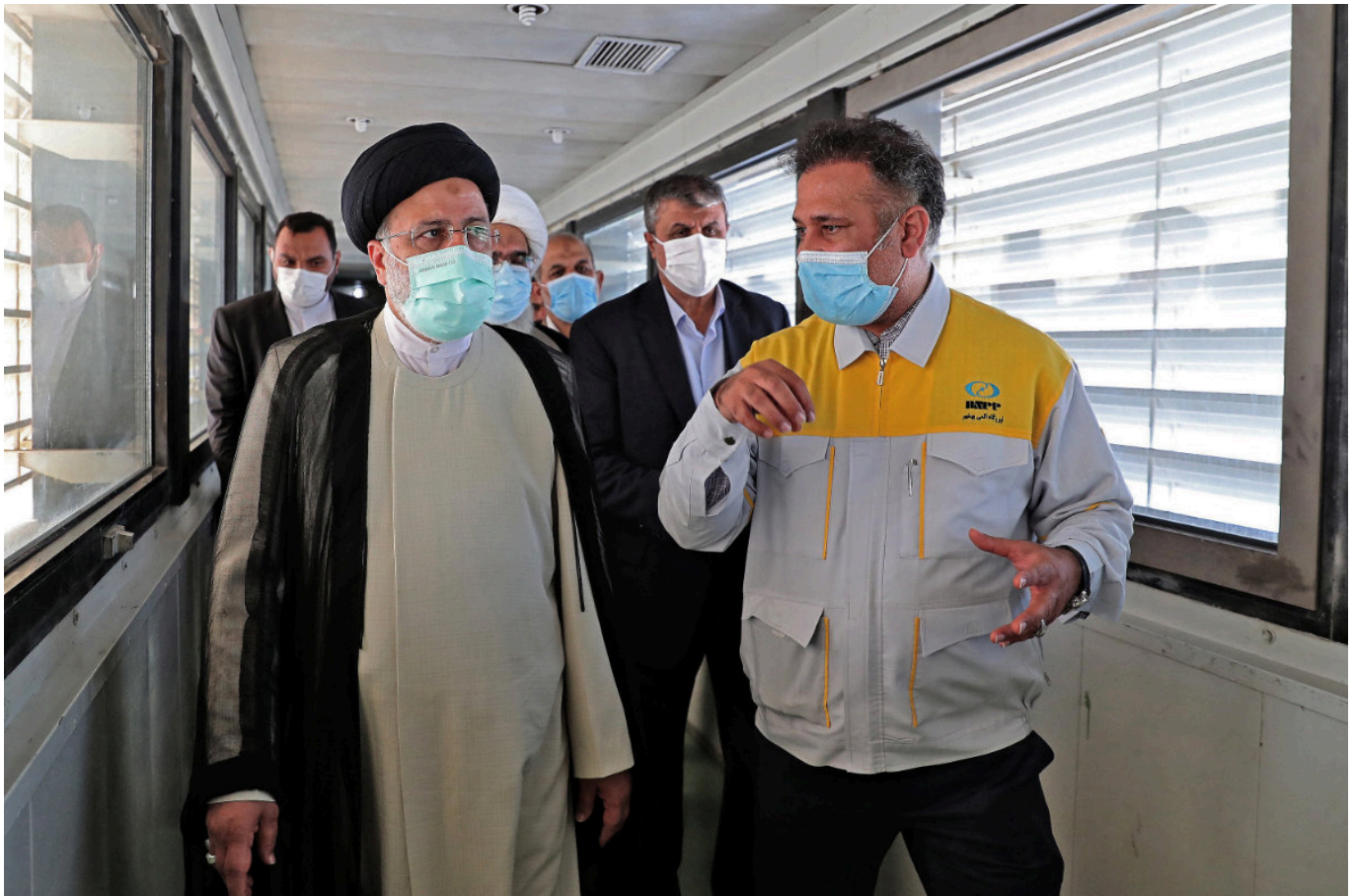
A handout picture provided by the Iranian presidency on Oct. 8, 2021 shows Iran's President Ebrahim Raisi visiting the Bushehr Nuclear Power Plant.

Barnea and Benny Gantz, Israel's defense minister, made a rare joint trip to Washington last week where they reportedly pressed senior White House officials on the need to seriously consider joint strikes on key Iranian military and nuclear targets.