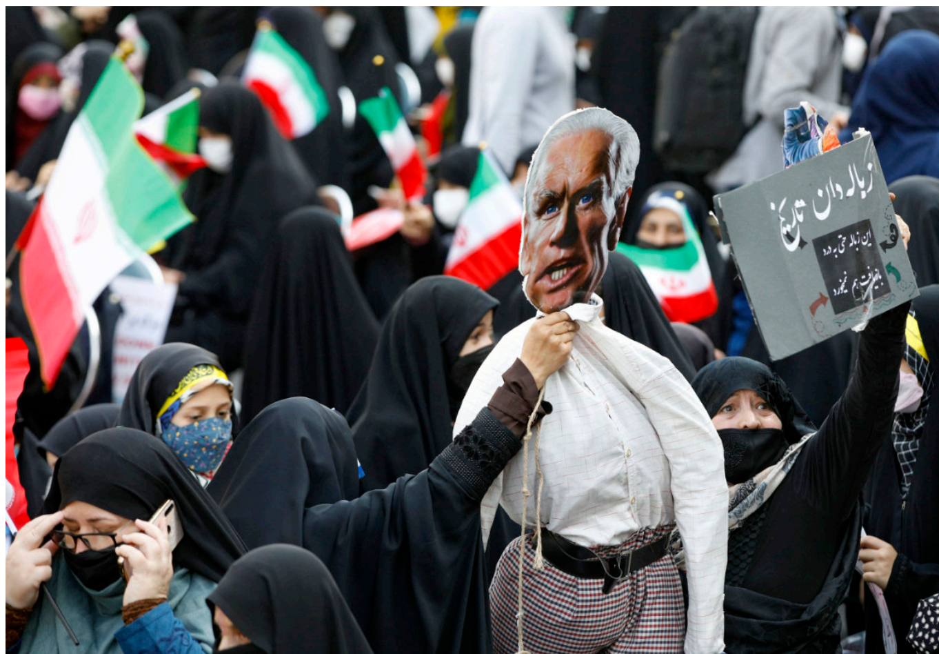
Iranian protesters raise a dummy of US President Joe Biden during a rally outside the former US embassy in Tehran on Nov. 4, 2021, to mark the 42nd anniversary of the start of the Iran hostage crisis.

Such an incremental deal could end up further emboldening Iran's regional transnational terror network by providing Shiite proxies in Iraq, Lebanon, Syria, Yemen and beyond with funding previously denied to them under harsh sanctions.