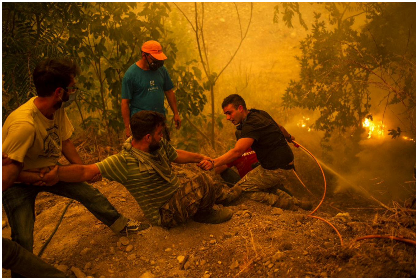
Local residents fight the wildfire in the village of Gouves on Evia (Euboea) island on August 8, 2021.

At COP26 in Glasgow in November, he was received as a hero by environmentalists. He declared: “Finance is becoming a window through which ambitious climate action can deliver a sustainable future that people all over the world are demanding.”