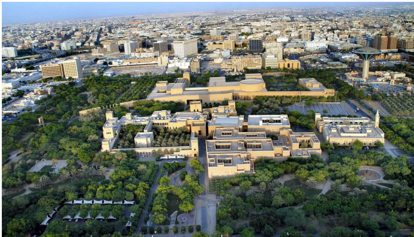
A view of the Saudi capital, Riyadh.

When Crown Prince Mohammed Bin Salman announced the Saudi Green and Middle East Green Initiatives at a special event in Riyadh, it was a landmark event in the region. Not only did it contain a goal for Saudi Arabia to reach net-zero greenhouse gas emissions by 2060, but it also stepped up the amount of harmful emissions that would be reduced under the nationally determined contributions schedule agreed with the UN and climate bodies.