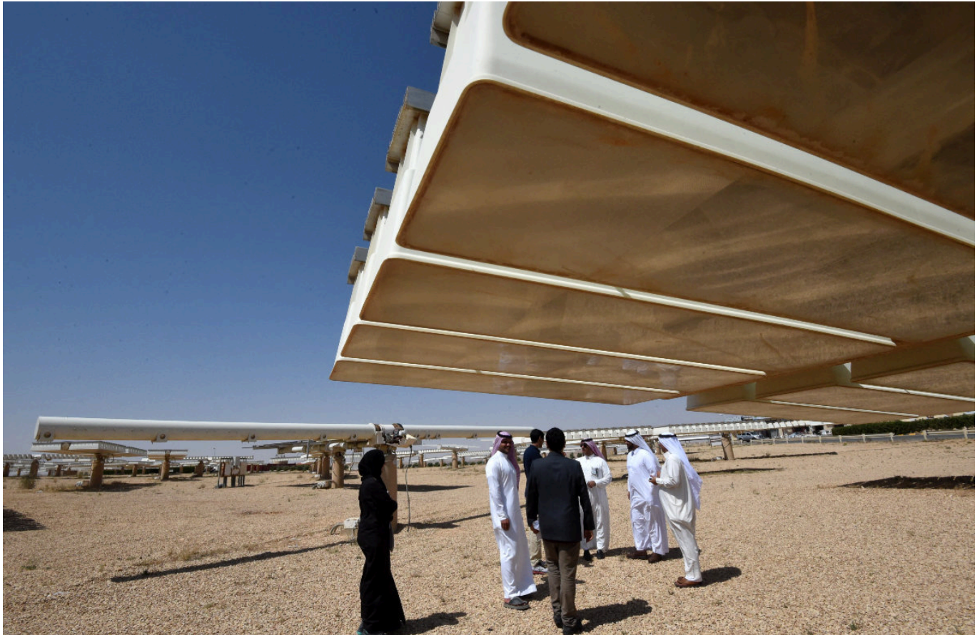
A general view shows the solar plant in Uyayna, north of Riyadh, Saudi Arabia, on March 29, 2018.

Prince Abdulaziz Bin Salman, the Kingdom's energy minister, underlined the seriousness of the campaign against global warming. "It is most daunting challenge that we are faced with. We have, I think, the most humane initiative that we could ever come up with, and we're willing to enlarge it if everybody wants to enlarge it. I'm sure that people have noticed that we have been repositioning ourselves," he said at the Future Investment Initiative in Riyadh in October.