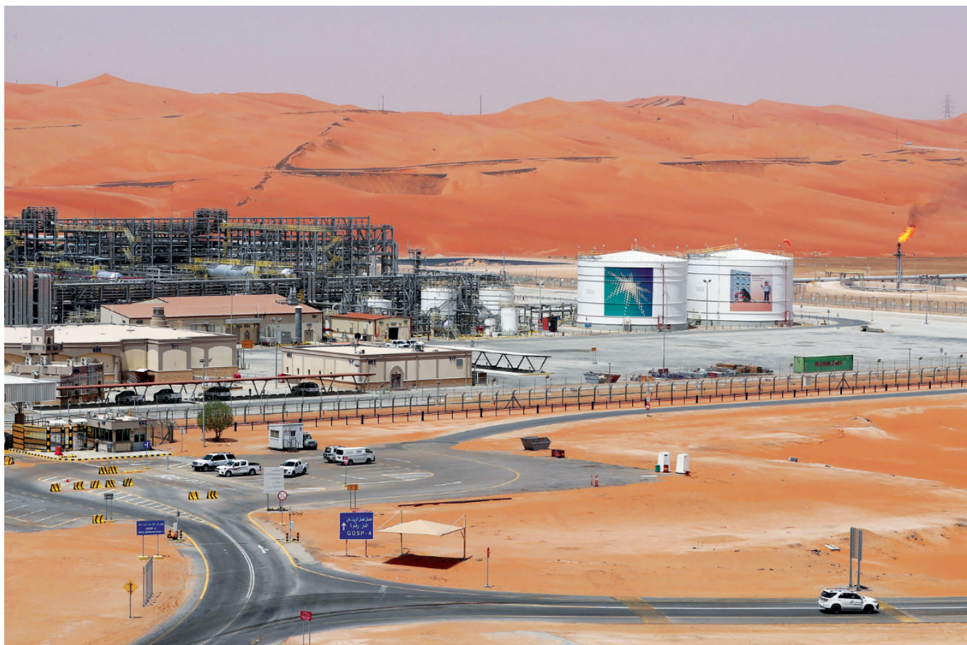
Saudi Aramco's Shaybah plant in the Eastern Province of Saudi Arabia.

For the Middle East, the climate change challenge gets very real indeed from now on. COP27 will take place next year in Cairo, and COP28 is earmarked for the UAE in 2023.