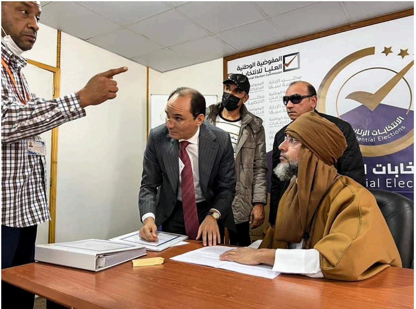
A handout picture released by the Libyan High National Commission on Nov. 14, 2021, shows Seif Al-Islam Kadhafi (right) registering as presidential candidate.

A Tripoli court sentenced Qaddafi to death in 2015 for war crimes committed during the battle to prolong his father's 40-year rule in the face of the 2011 NATO-backed uprising. However, he was granted an amnesty and released the following year by the UN-backed government. He remains a figurehead for Libyans still loyal to the government of his father.