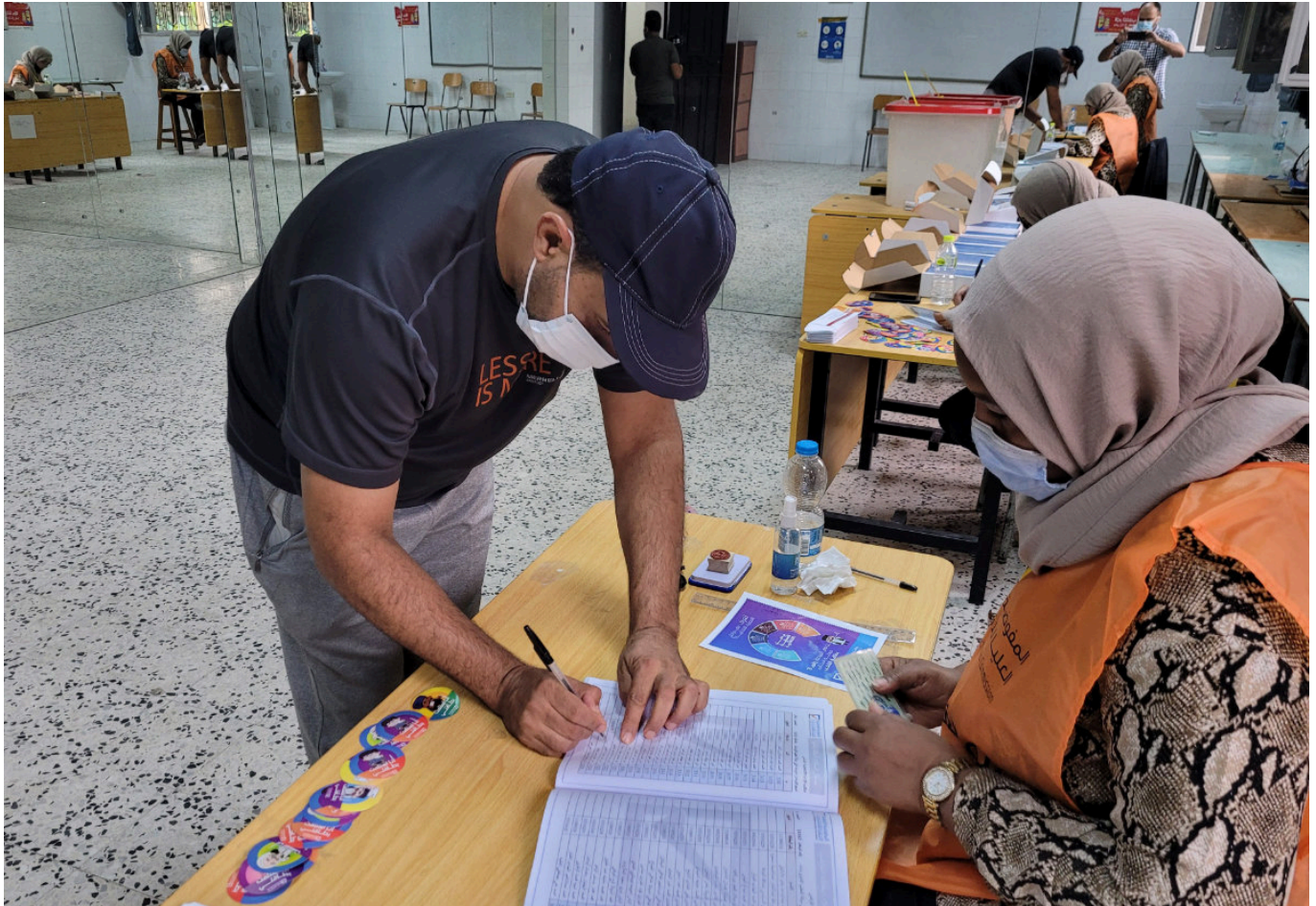
A Libyan man registers to vote inside a polling station in Tripoli on November 8, 2021.

A provisional Government of National Unity, headed by Abdul Hamid Dbeibah, was approved by lawmakers on March 10, 2021. On September 9, however, Aguila Saleh, the speaker of Libya's parliament, ratified a law governing the presidential election that was seen as bypassing due process and favoring Haftar.