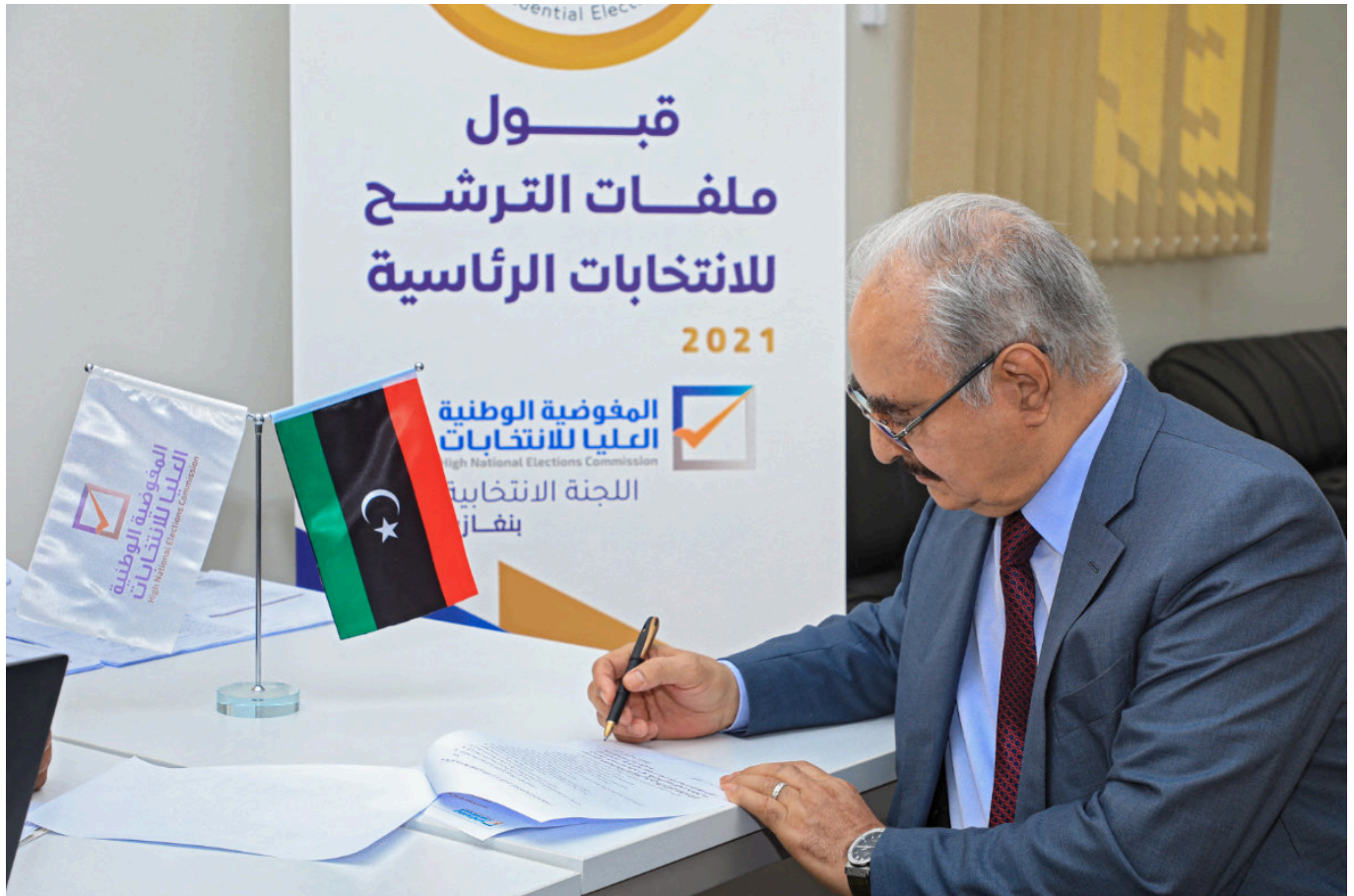
Khalifa Haftar submits documents for his candidacy for the Libyan presidential election at the High National Election Commission in Benghazi on Nov. 16, 2021.