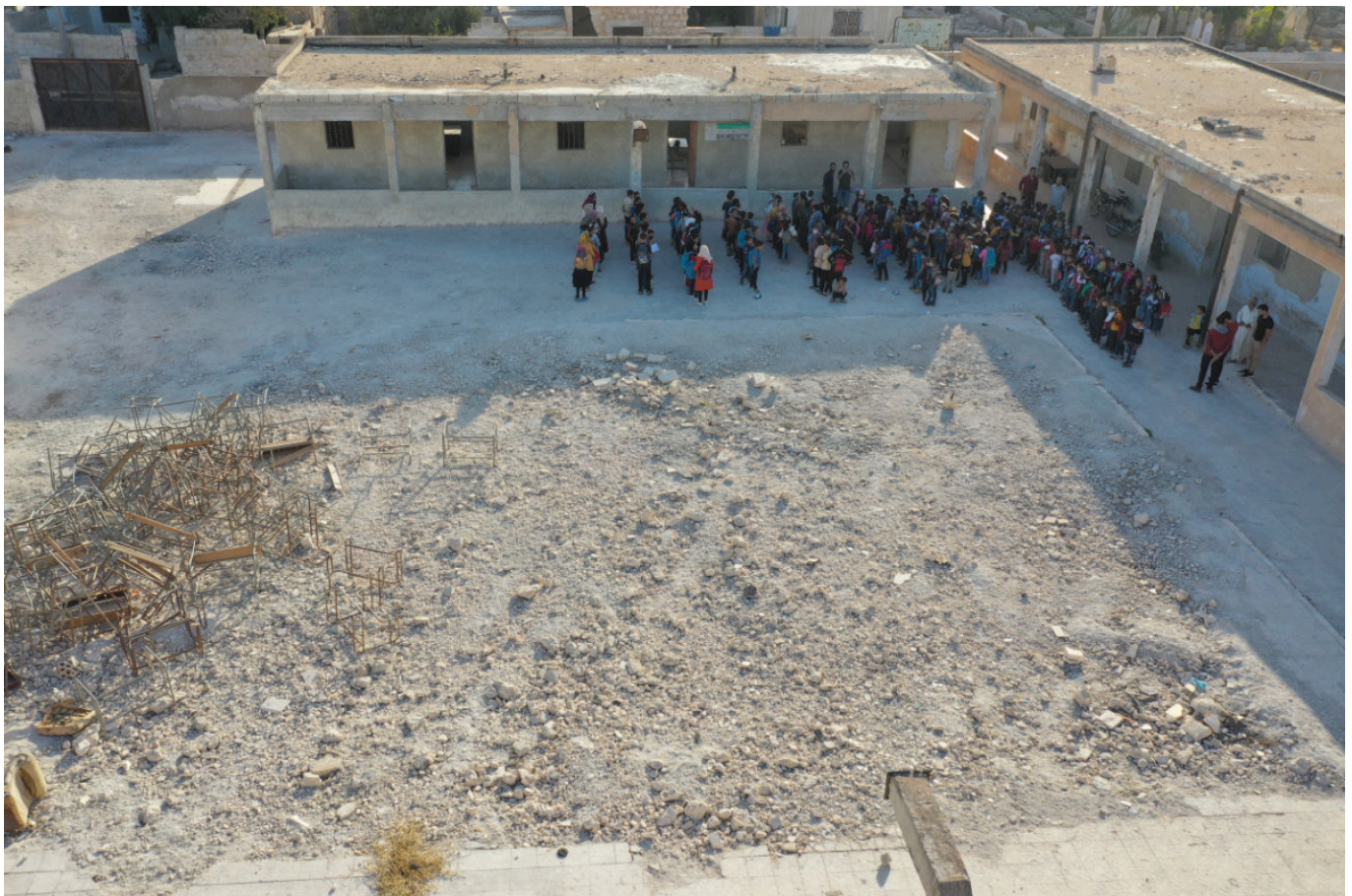
Children in northwest Syria are unable to go to school due to constant bombing and displacement.