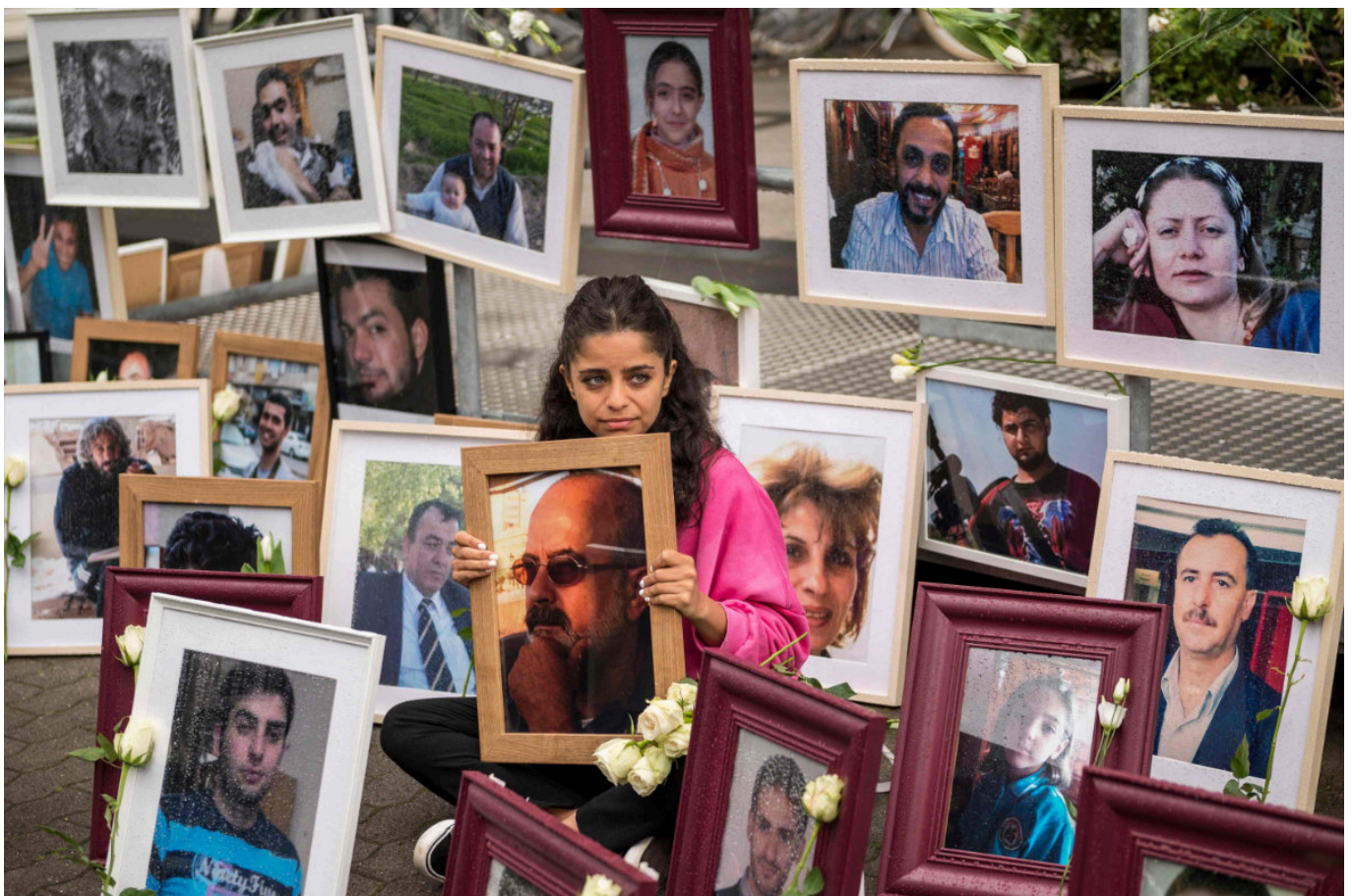
Pictures of Syrian regime victims are displayed during a protest in Koblenz,