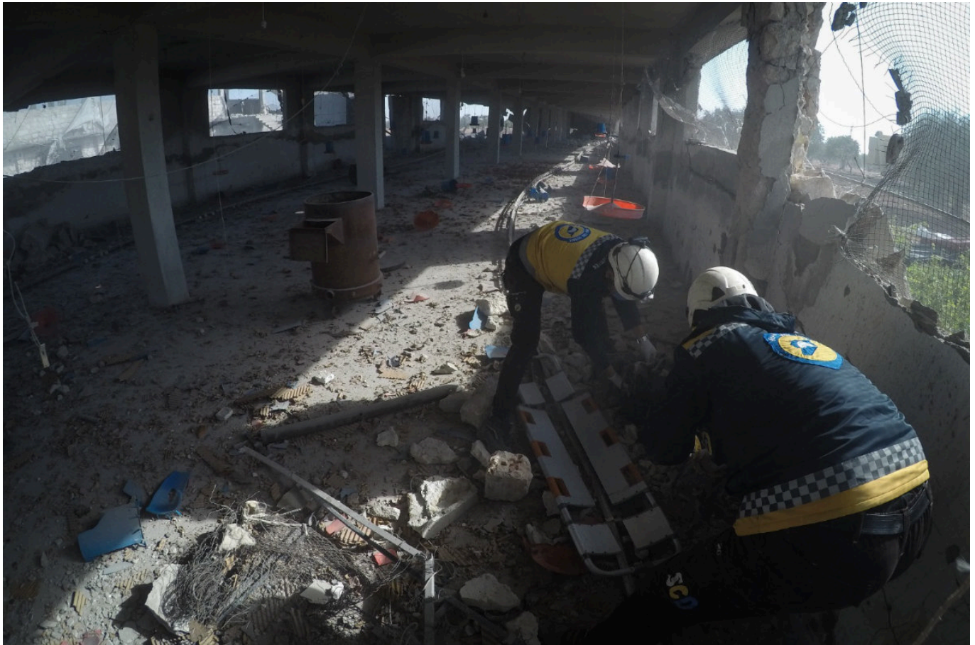
Syria's White Helmets volunteers search through the rubble of a building destroyed by an exploding bomb in Idlib.

One photograph released by the White Helmets in mid-November shows first responders lifting the lifeless body of a little girl from the rubble of what used to be her home. Such images were once front-page news. Now they barely register on the news media's radar.