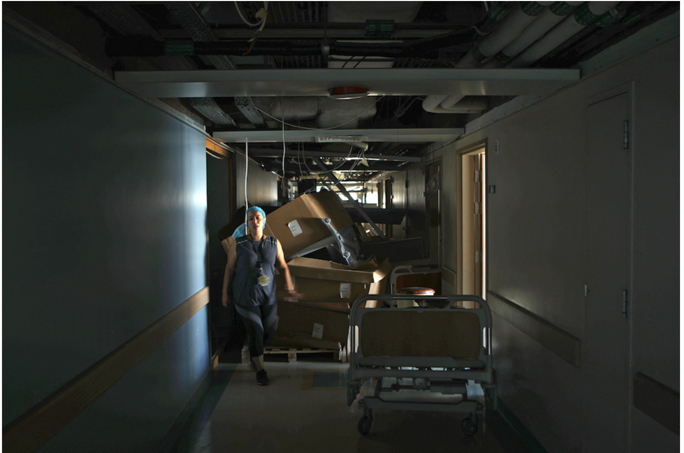
The damaged Saint George hospital (left) in Beirut more than a week after the port blast of Aug. 4, 2020. Some 43,000 Lebanese emigrated in the first 12 days after the explosion, including skilled workers such as medical staff.

More than 220 people were killed in the blast, about 7,000 injured, and some 300,000 left homeless. Within hours of the explosion, people began to pour into the city's hospitals with all kinds of trauma, disfiguring burns and wounds caused by flying glass and masonry.