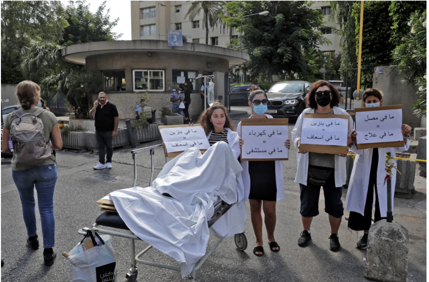
Protesting pharmacists (above) hold signs saying “no gasoline = no ambulance,” denouncing the critical condition facing the country’s hospitals while grappling with dire fuel shortages.

About 19.5 percent of Lebanon's population of 7 million are refugees from neighboring countries. Already living precariously in impoverished communities, few of them have the means or the connections to obtain vital medications at a time of scarcity.