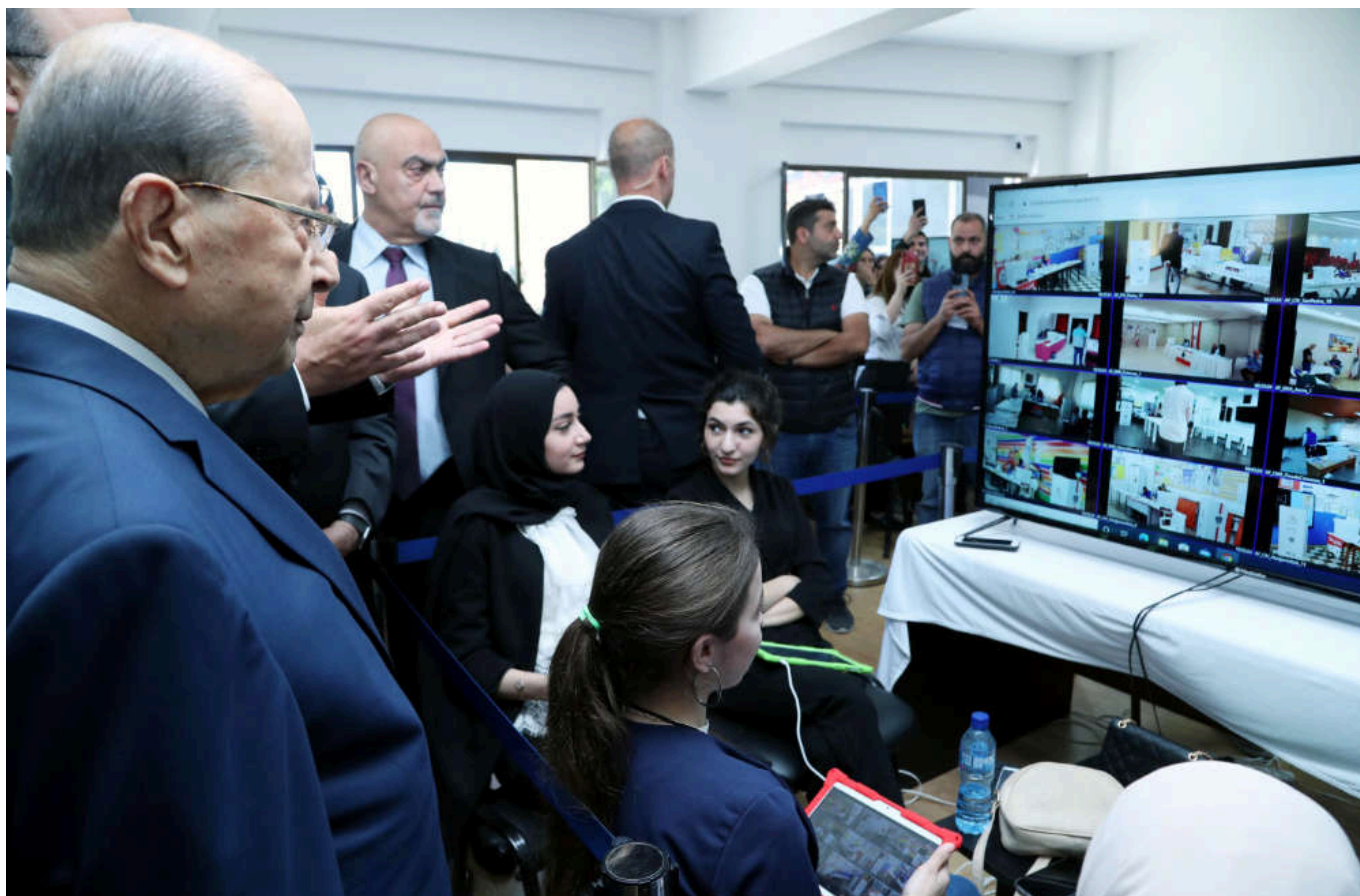
President Michel Aoun visits the Ministry of Foreign Affairs.

Turnout is low compared to the last national elections in 2018. The weak voting rate has even been reflected in some countries where voters have explicitly expressed affiliation with Hezbollah and the Amal Movement.