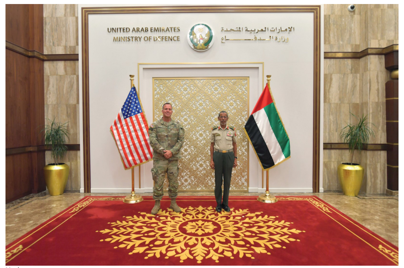
Main category: <u>Middle-East</u>

During their meeting, they reportedly discussed the friendly relationship between their nations and various aspects of bilateral cooperation and coordination, particularly in the defense and military sectors. They also exchanged views on a number of issues of mutual concern.