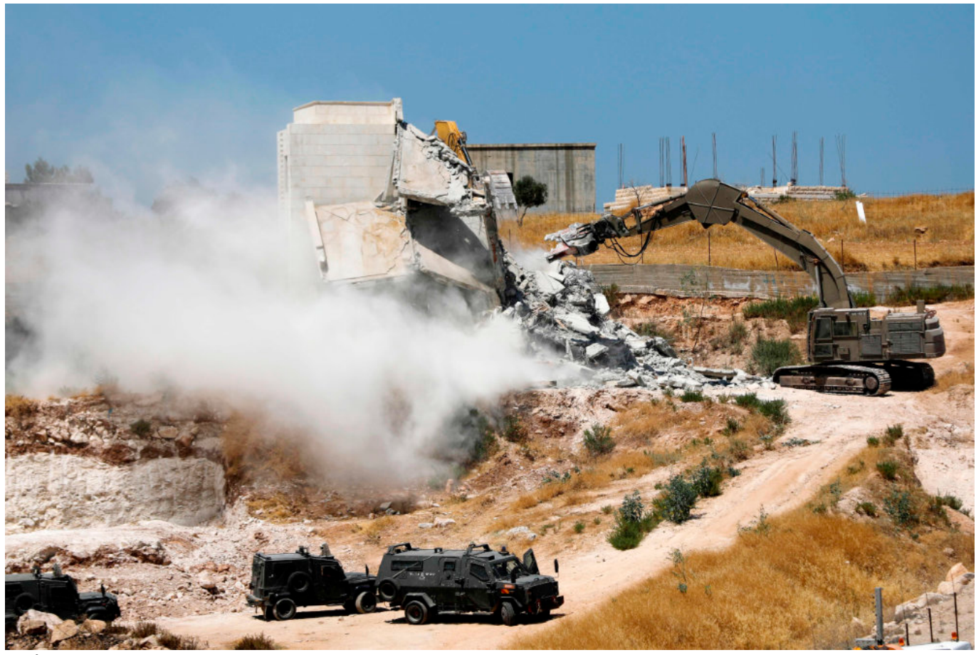
Main category: <u>Middle-East</u>