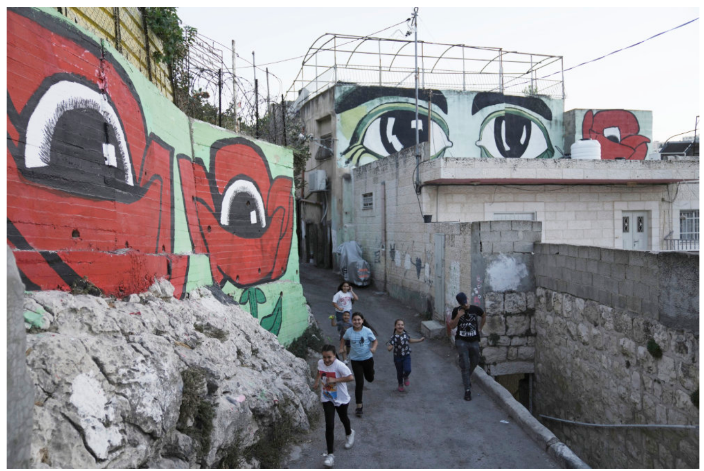
Main category: <u>Middle-East</u>