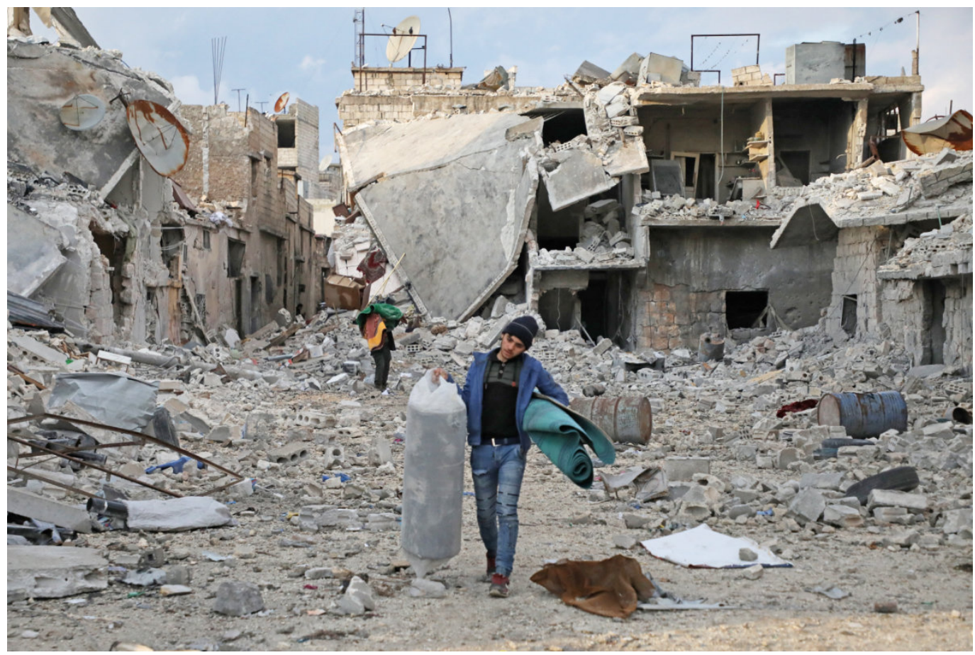
Main category: <u>Middle-East</u>