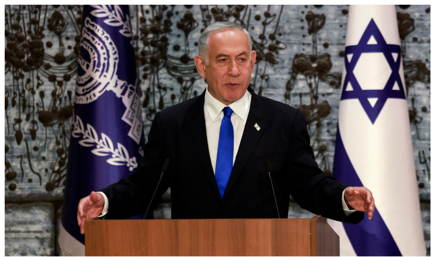
Main category: Middle-East