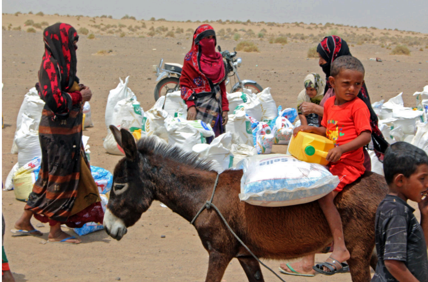
Main category: Middle-East