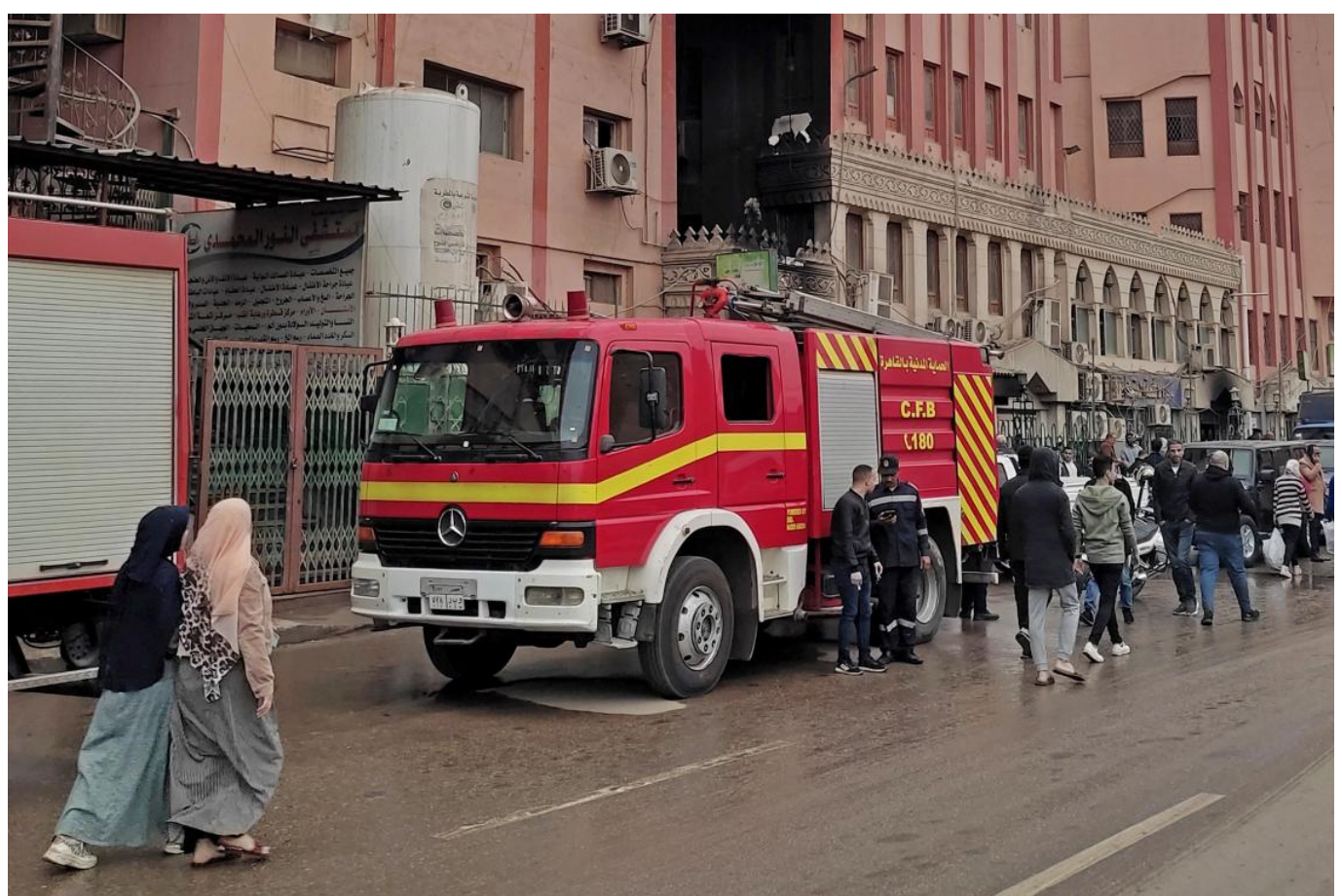
Main category: Middle-East

in eastern Cairo's Matariya neighborhood. The facility is run by a charity. The ministry said in a statement that flames broke out at the hospital's radiology department without elaborating on what caused it. Provincial authorities said firefighters were able to put out the blaze.