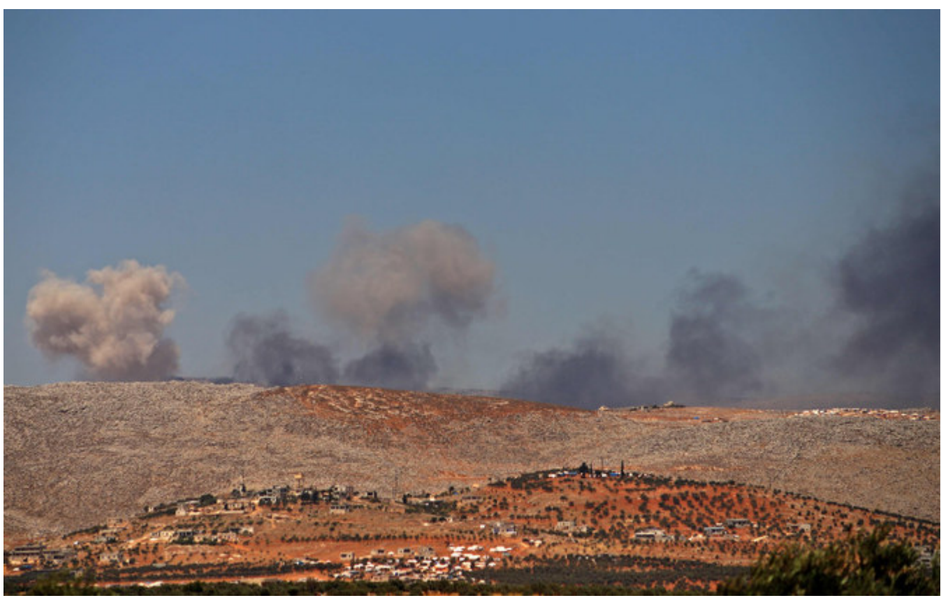
Main category: Middle-East