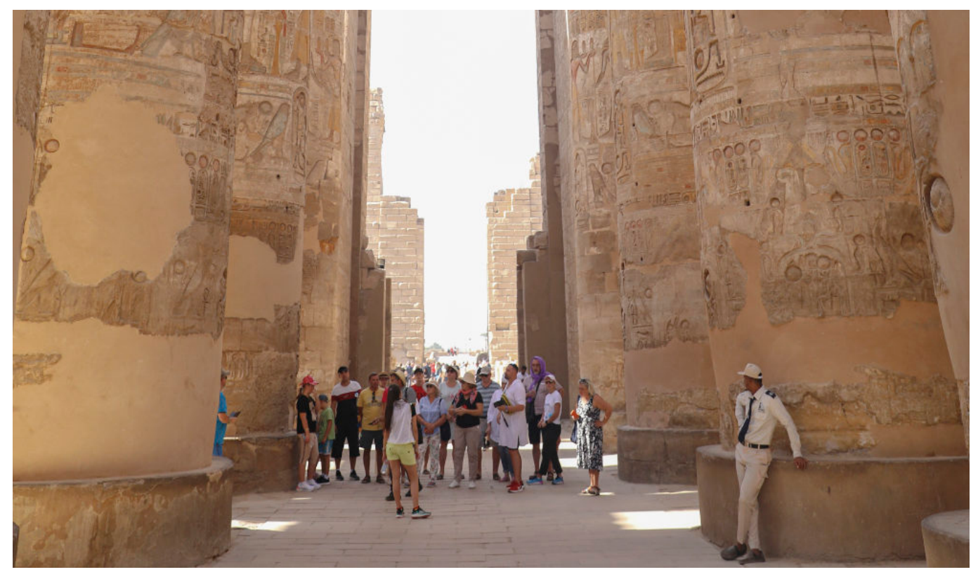
Main category: Middle-East