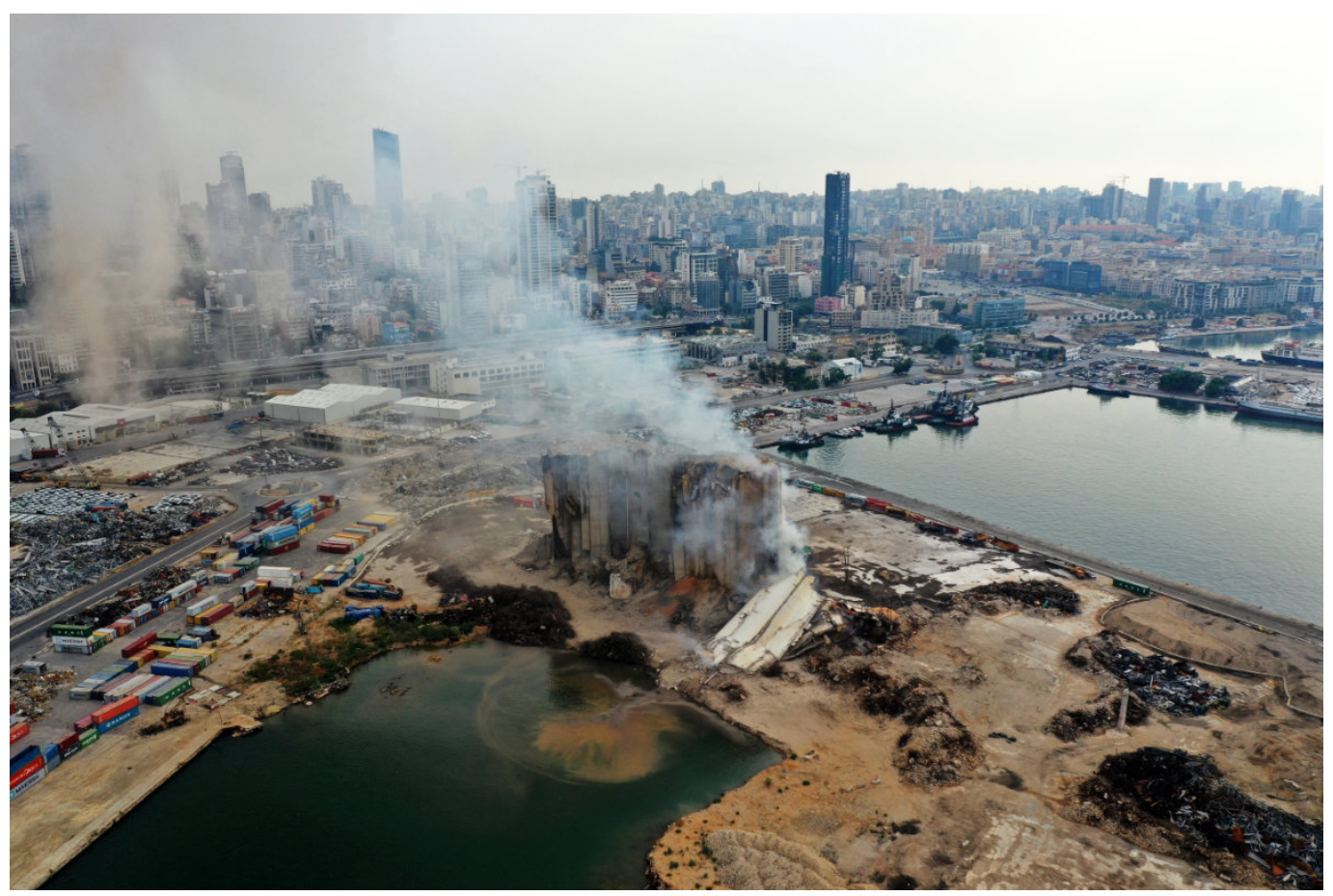
Main category: Middle-East