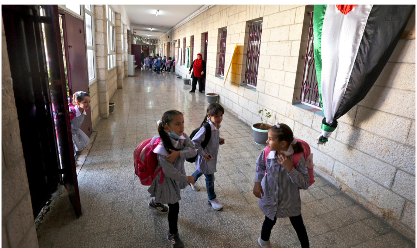
Main category: Middle-East

On Sunday morning, thousands of students returned to their homes because of the strike.