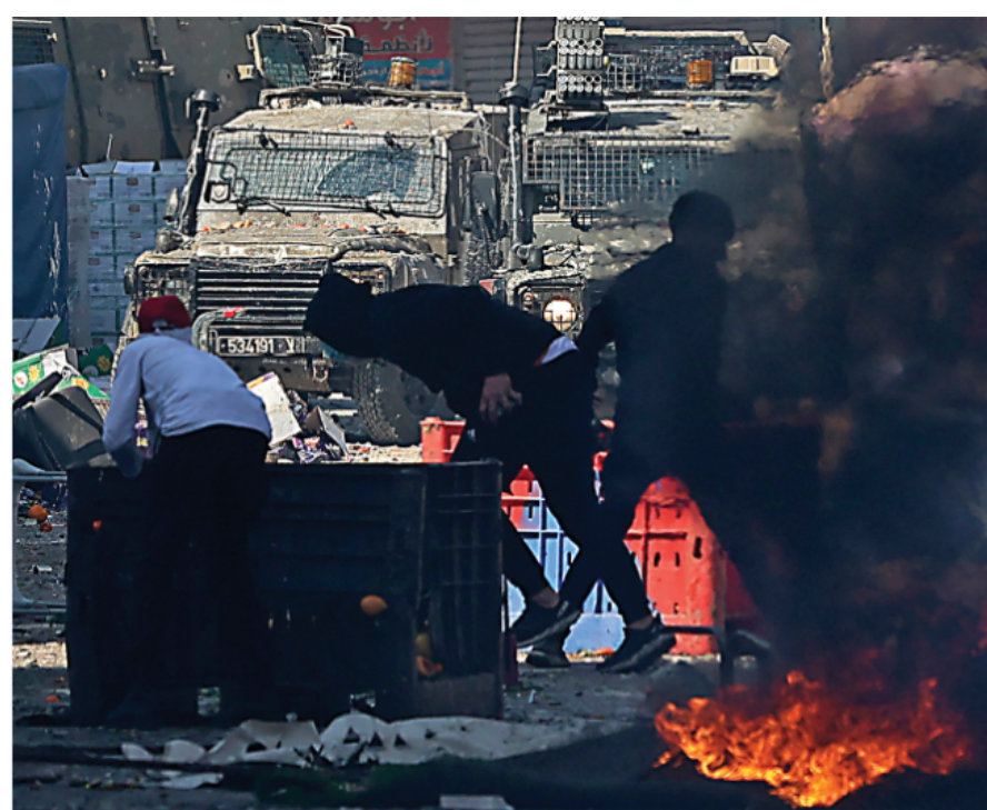
Main category: <u>Middle-East</u>