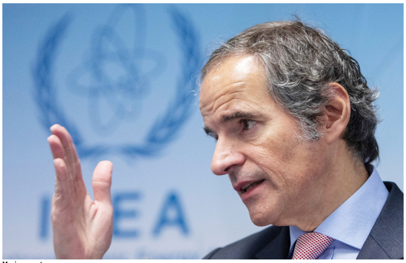
Main category: Middle-East

Two days before a quarterly meeting of the International Atomic Energy Agency's 35-nation Board of Governors, the IAEA and Iran said they had agreed to make progress on various issues, including a long-stalled IAEA inquiry into uranium particles found at three undeclared sites in Iran.