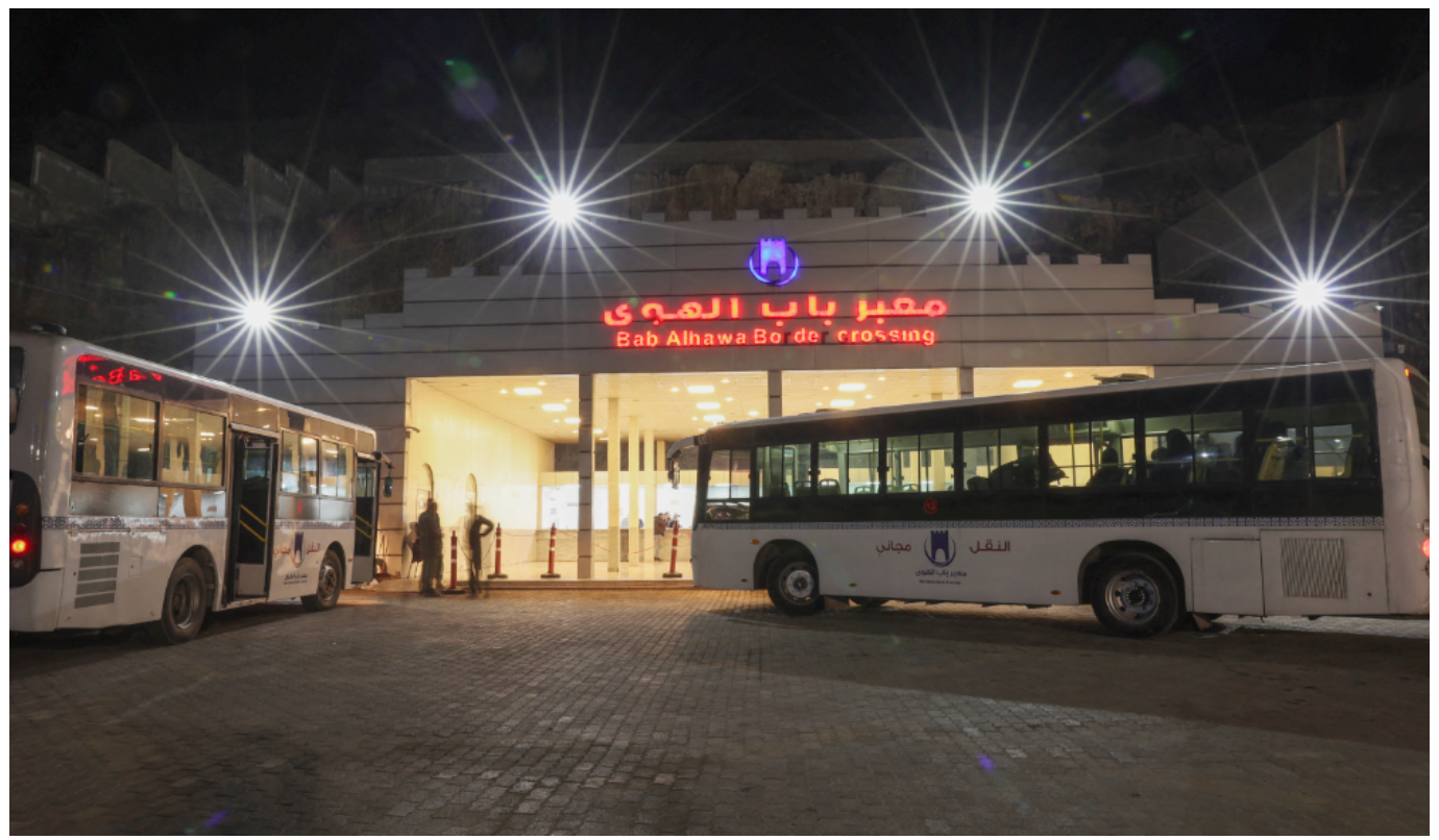
Main category: Middle-East

That changed when the Turkiye-Syria quake rocked the region and prompted Turkish authorities to close the borders on those awaiting lifesaving treatment.