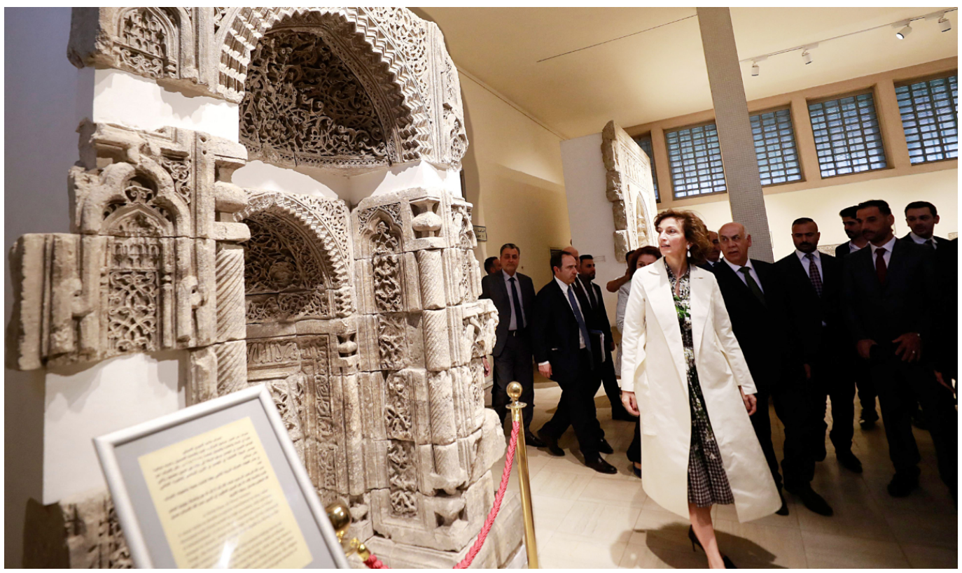
Main category: <a href="Middle-East">Middle-East</a>

"This visit is dedicated to reconstruction in Iraq," said a spokesman for the UN Educational, Scientific and Cultural Organization which funds several projects in Iraq.