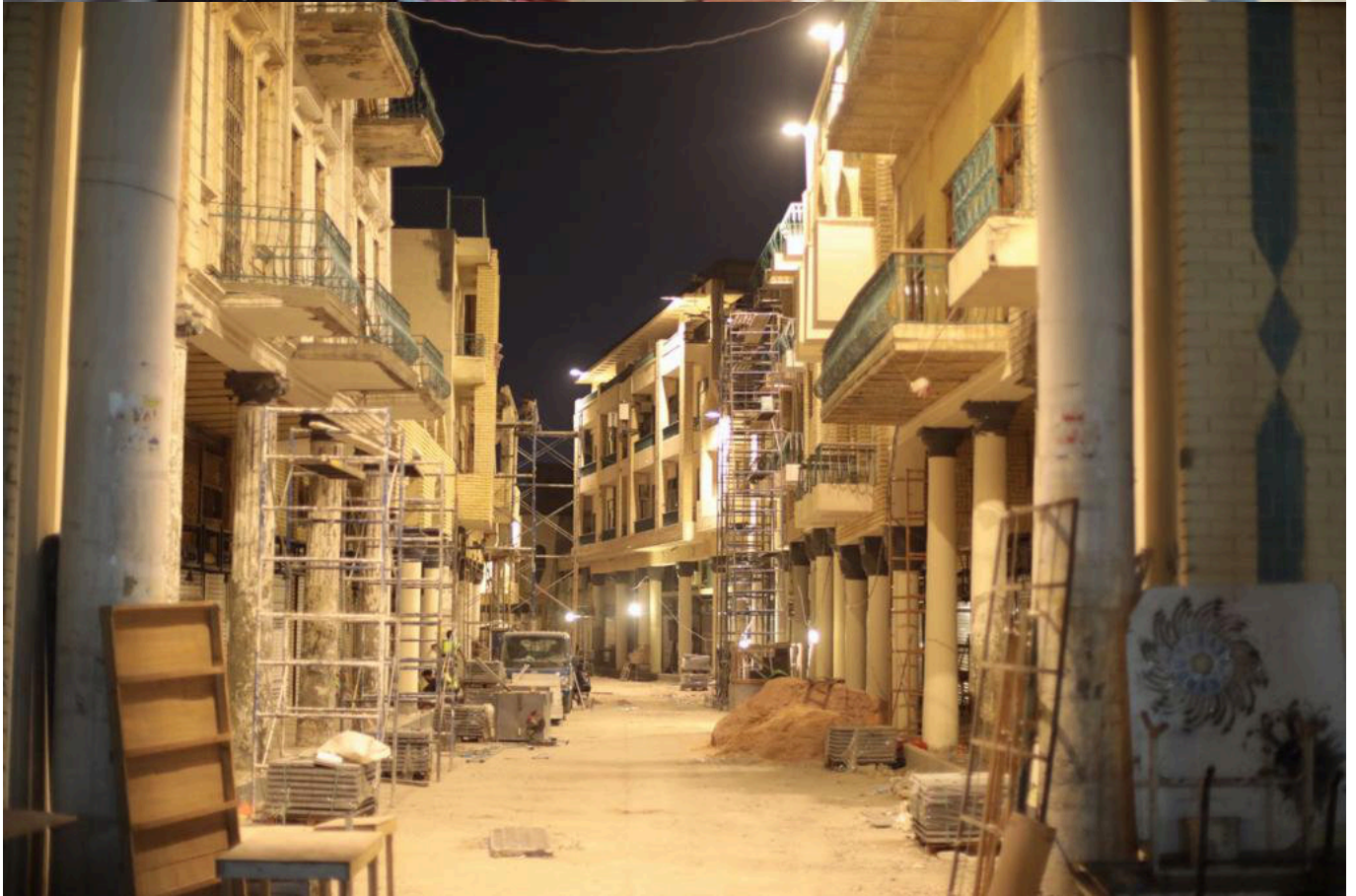
Main category: Middle-East