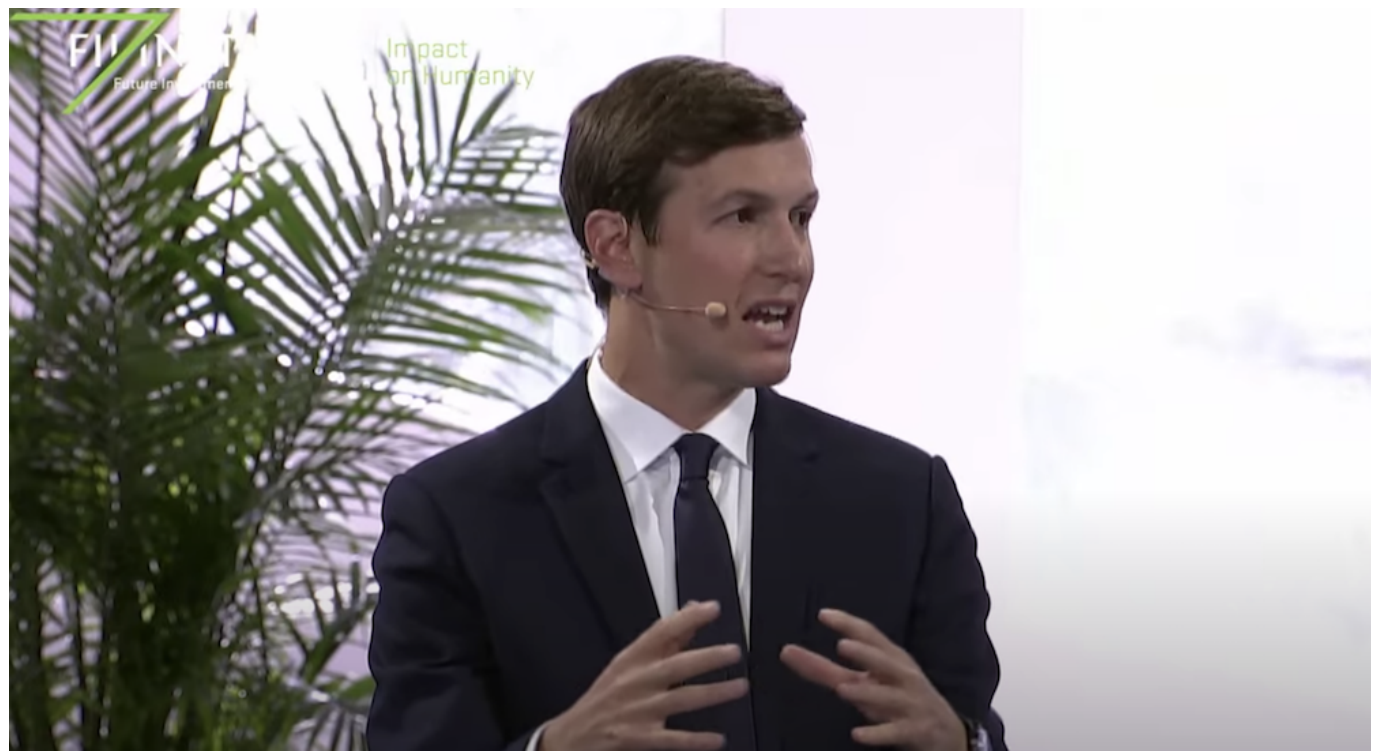
Main category: Middle-East

Speaking at the FII Priority conference in Miami, the former senior Trump adviser said the peace deals were hugely important for the stability of the Middle East.