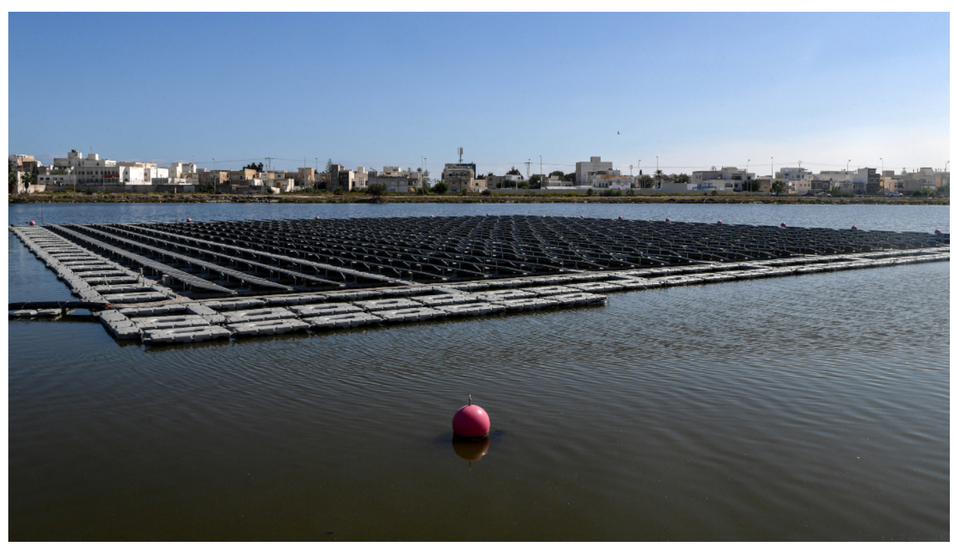
Main category: Middle-East