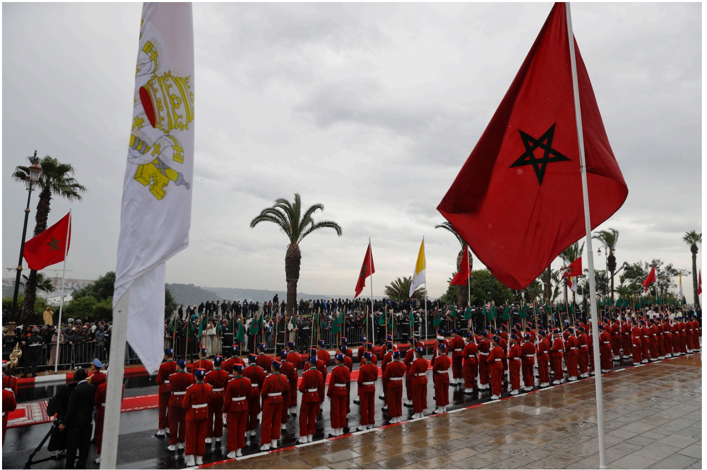
The honor guard waits for Pope Francis to arrive in Rabat, Morocco, Saturday, March 30, 2019.

Those who try to “rock the faith of a Muslim or to convert him to another religion” risk a prison term of up to three years.