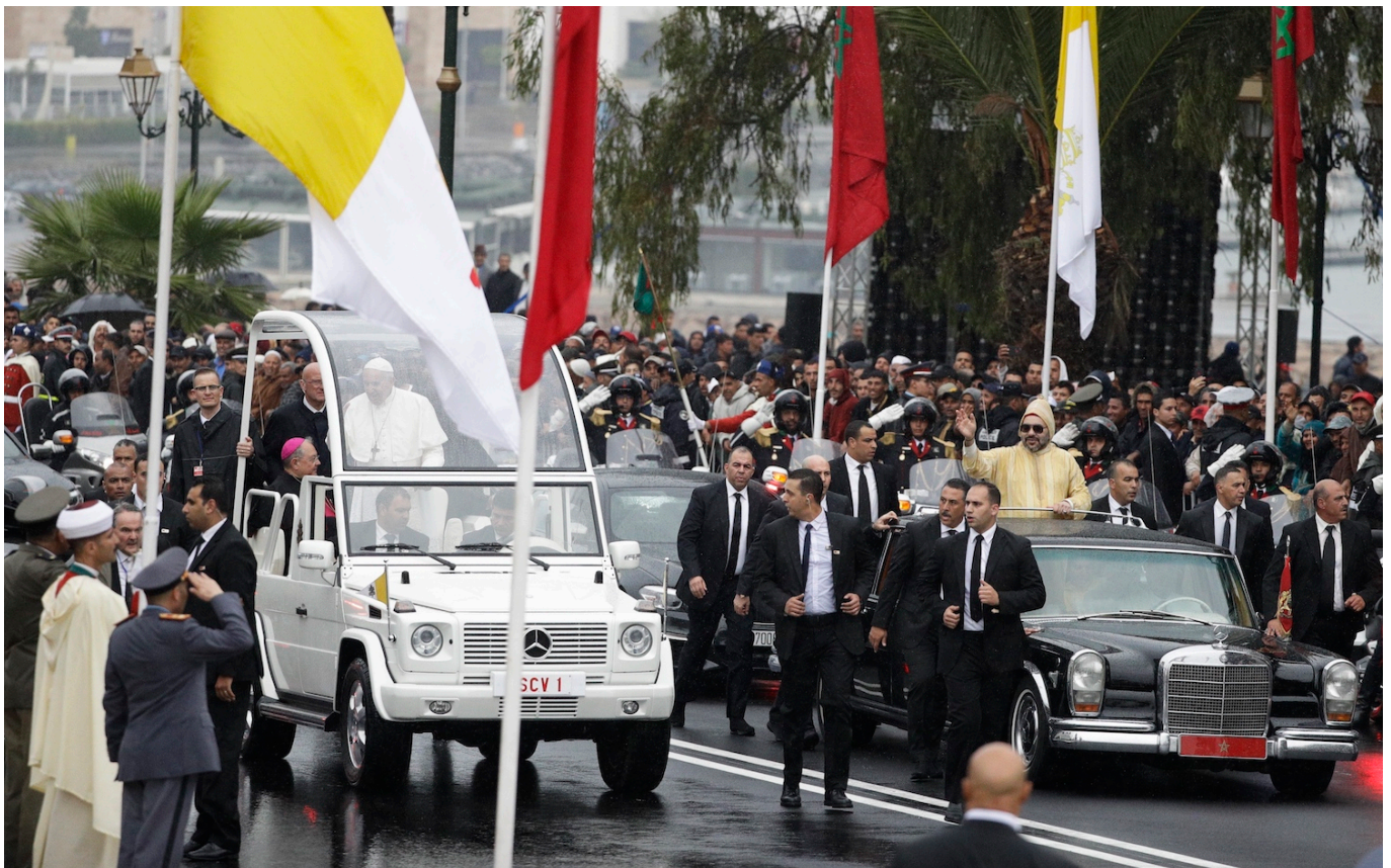
Pope Francis, on the popemobile, and Moroccan King Mohammed VI, right, waving, make their way through the crowd in Rabat, Morocco, Saturday, March 30, 2019.

The pope's plane landed in the capital Rabat shortly before 2 pm (1300 GMT) and he was greeted by the king who is known as the "commander of the faithful" in Morocco, where 99 percent of the population is Muslim. The Moroccan capital has stepped up security ahead of the first papal visit to the North African country since John Paul II in 1985.